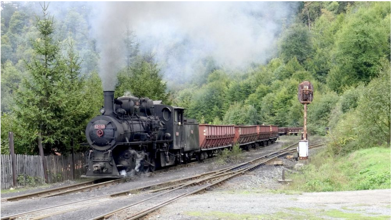
83-158 departing Oskova on a freight charter