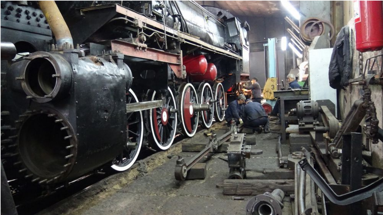
Bukinje Workshop with a class 33 under repair

This tour is firmly focussed on the remaining real working steam at Dubrave (sg), Sikulje (sg) and Oskova (ng) and also includes 2 charters; a full line charter at Banovici and the Oskova standard gauge shunt with steam substituting for diesel. A second line charter at Banovici is an option.