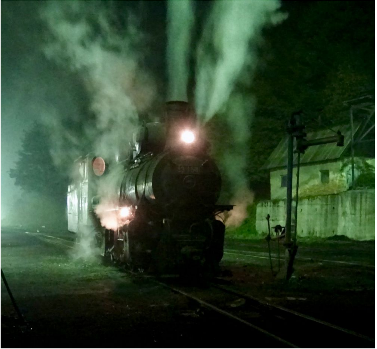
The potential of night shots at Oskova