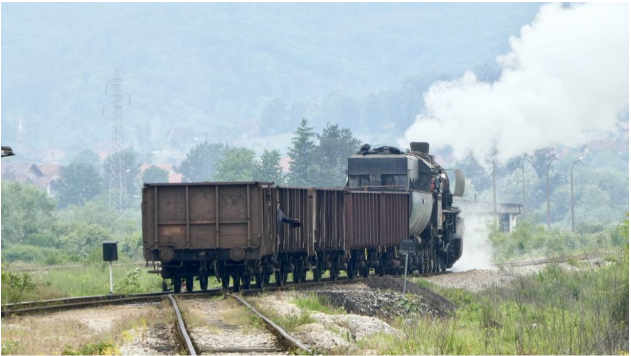
Shunting at Sikulje