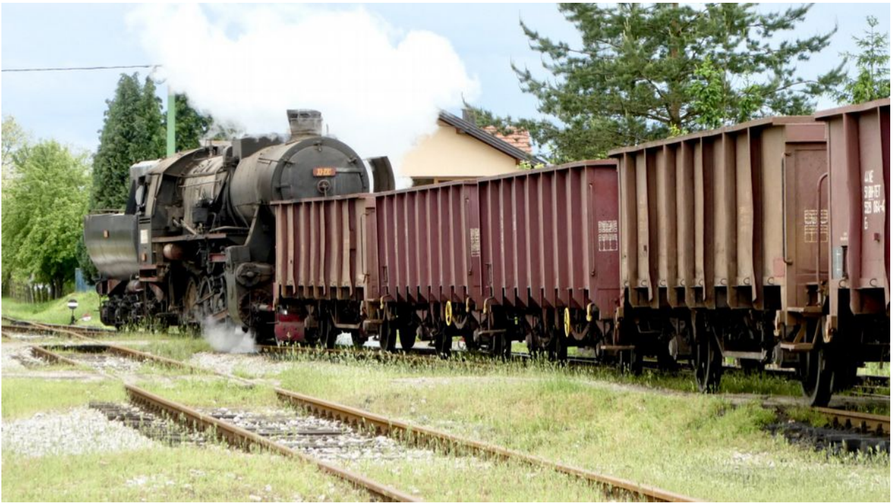
Kriegslok 2-10-0 33-236 shunting at Dubrave