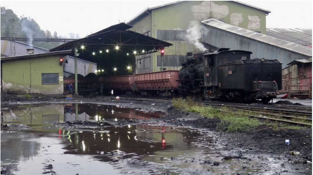
83-158 shunting at Oskova