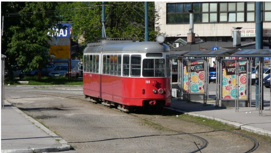
Sarajevo tram at the main railway station terminus

You will also enjoy Bosnian food, beer, wine and slivovitz including an evening with music at an ethnic restaurant and dinners at the Tuzla and Sarajevo brewery bier kellers as well as accommodation at the Banovici Coal Mine company's forest lodge 'Hotel Zlaca' (breakfast and dinner included and paid bar available) and lunch and/or dinner at the company's restaurant in Banovici with it's impressive Tito-era mural on the wall.