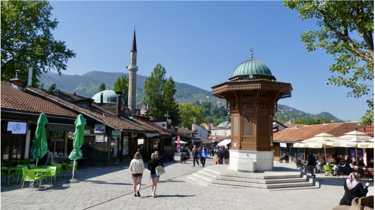
The east end of Old Sarajevo with a mosque and water fountain

A note on Deposits and Refunds Your deposit is a guarantee both of your place on the tour and also of your commitment to participate in the tour and to pay the balance of the price of your tour. Should you need to cancel your participation, it's reasonable for you to expect a deposit refund if that decision is made early enough. However, especially if a tour has been declared go with small numbers, one person withdrawing from a tour close to the tour start can push the tour from profit to loss. For that reason, there has to be a point when your deposit becomes non-refundable. I have chosen 2 months out from the start of the tour as that point. If you cancel before that point but after the tour has been declared go, your deposit is partially refundable and the level of the refund will depend on any expenses that may have been incurred in Bosnia on your behalf. In most cases, you can expect a full refund. In the unlikely event that I have to cancel a tour, your deposit is fully refundable but that, along with any additional money remitted to the Bosnian guides or me, will be the limit of my liability.