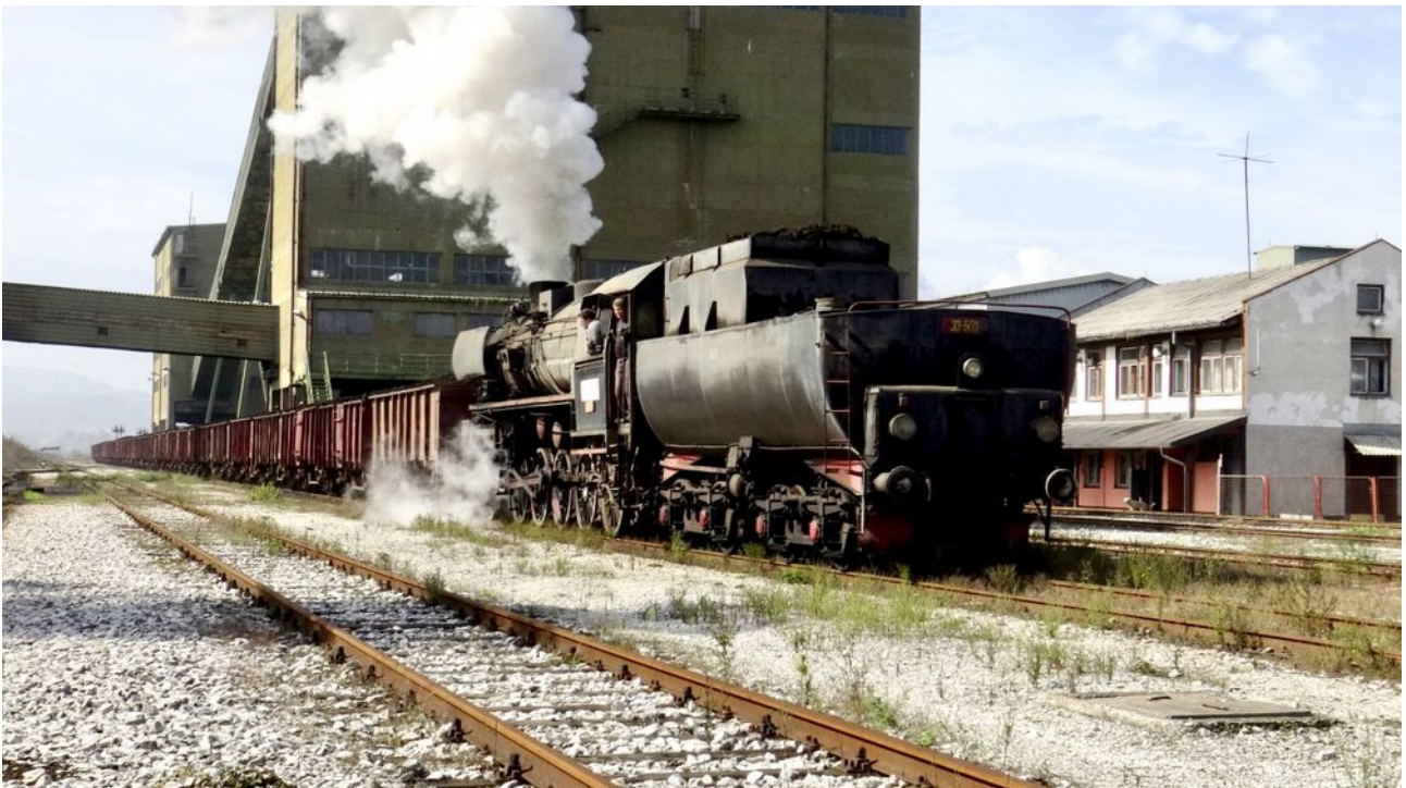
33-503 shunting at Sikulje