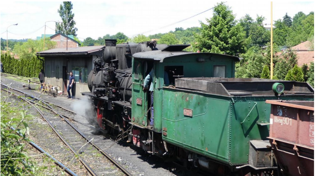
83-159 on a charter empty coal train at Banovici 'station'

There are 6 places remaining on this tour to make a maximum number of 12 participants. Prices quoted are estimates only at the moment and are based on 10 people participating.