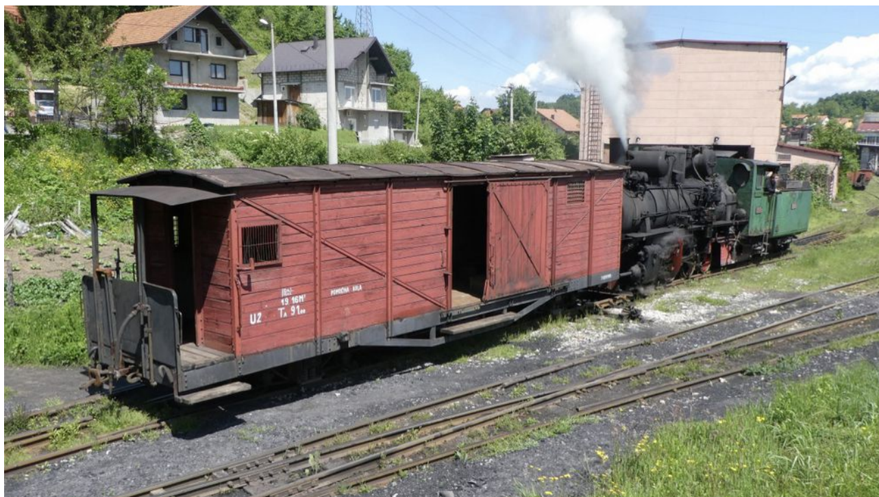
Class 83-158 prepares for a charter train at Banovici Works