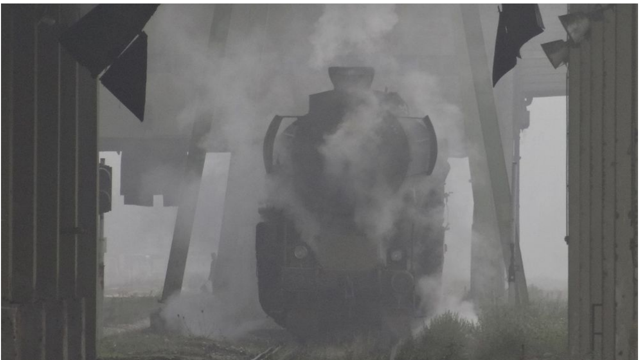
Kriegslok shunting at Sikulje