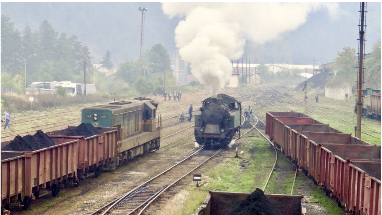
19-12 on the standard gauge shunt at Oskova