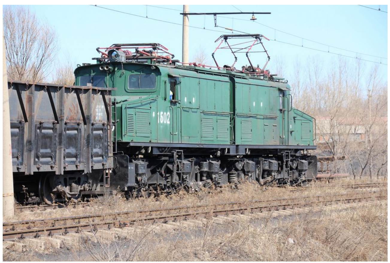
Two views of double electric 1502. We saw 1501 on shed at Hegang so this was the second one we saw.