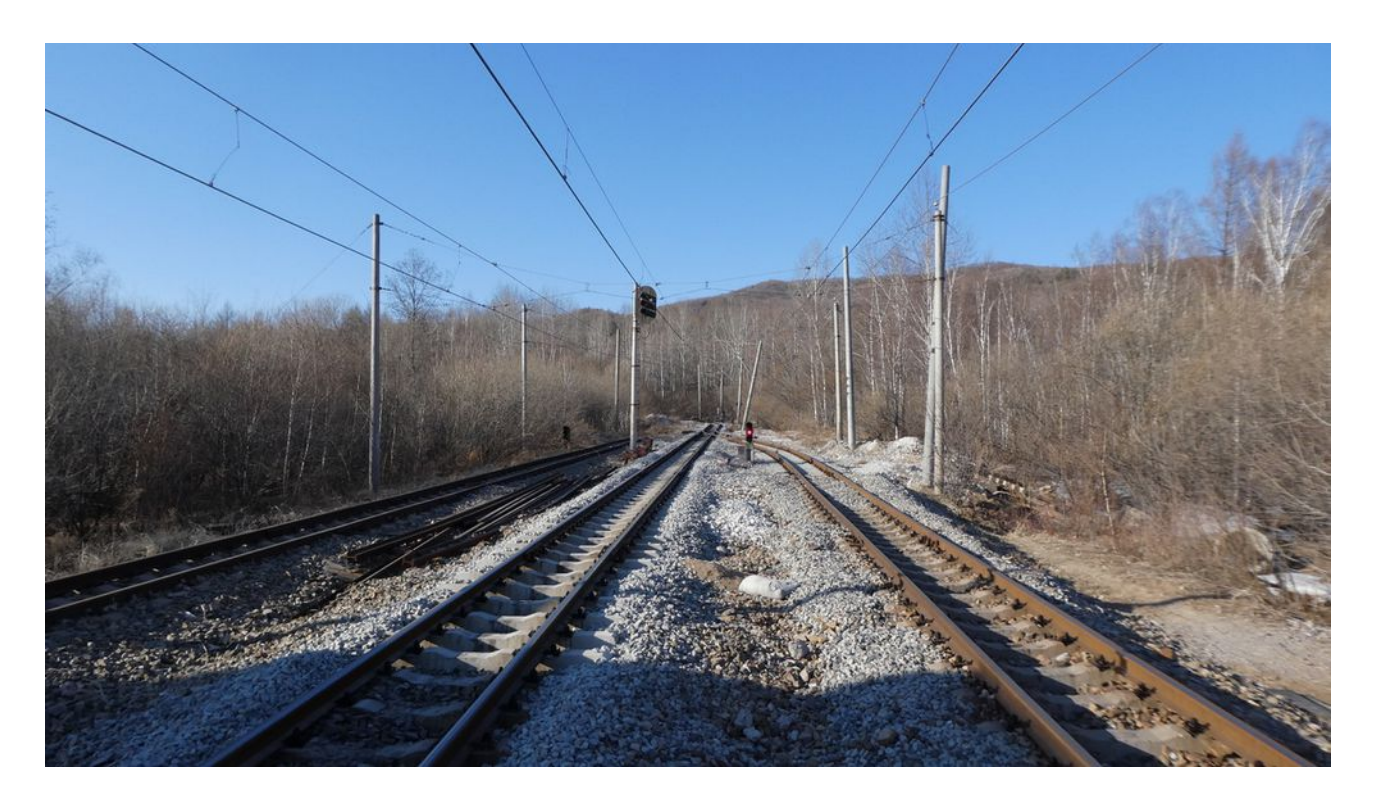
The 900mm gauge rails curve invitingly left at the end of the station towards the quarry. It's a pity we can't spend the next 2 days walking the line with passing trains.