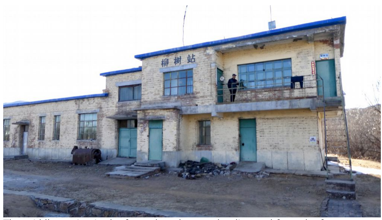
The middle station in the forest but close to the dirt road from the factory to the quarry. This was probably the Nancha - Jiamusi cross-country route I drove in the 1990s with the LCGB tour. We saw a new line and wondered what it would be used for - now I know.