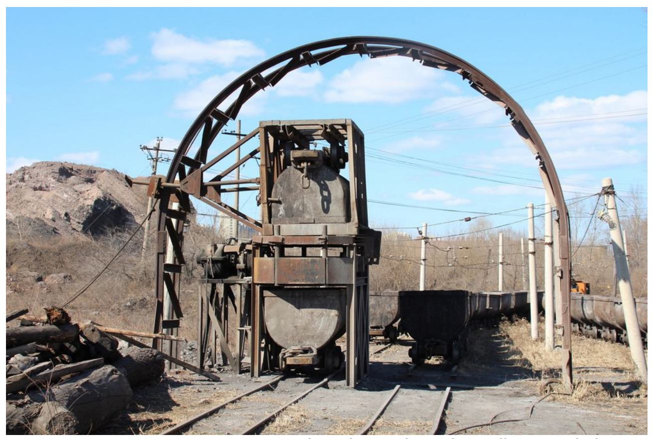
An interesting tipping structure. Are the tubs on the right really up-ended over one on the left by this structure and if so, why?