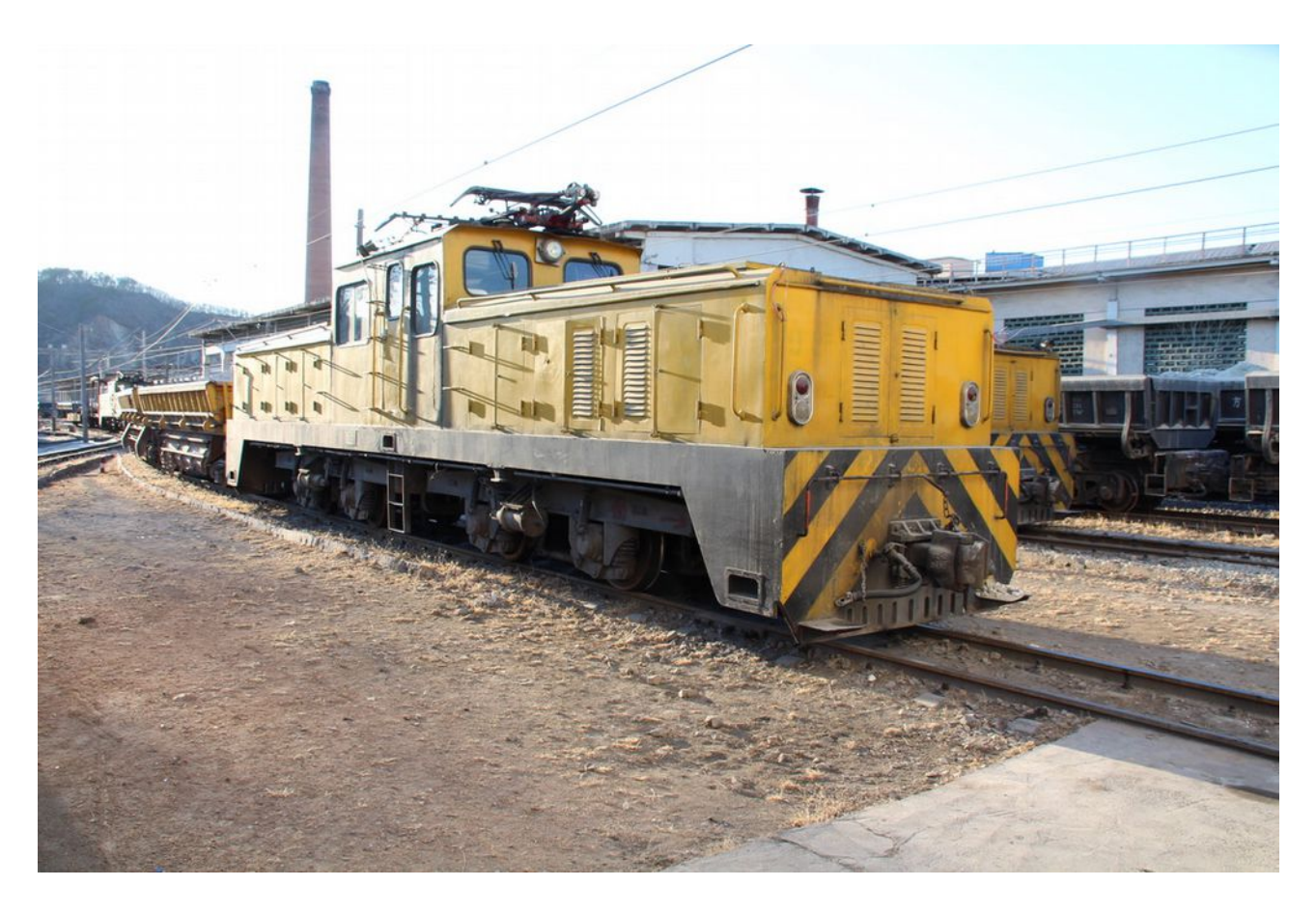
The first 3 photos are of what I take to be the mainline locos.