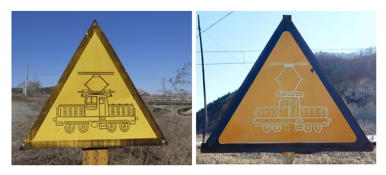
Two versions of an electric railway crossing sign at Haolianghe