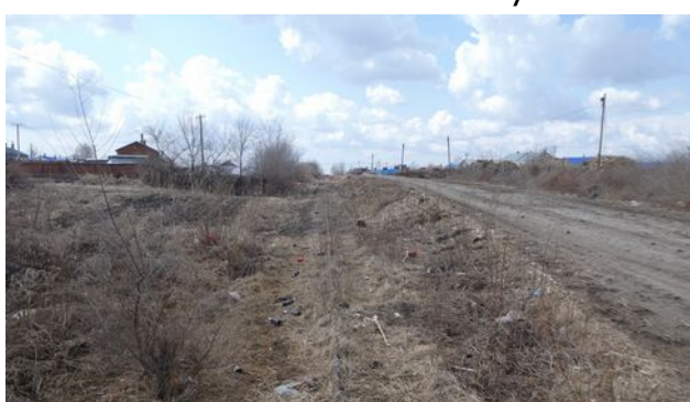
Track bed barely visible