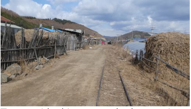
Tuoyaozi looking towards the passing loop