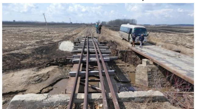
Bridge in need of repair

Views of the old line from beyond Km 2 at Huanan via Xiahua to Tuoyaozi