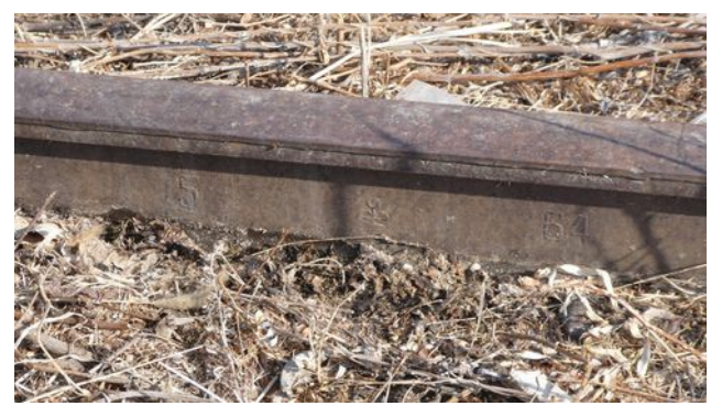
Rail marked 15 (symbol) 64