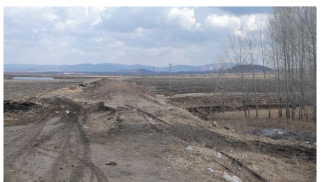
Rails no longer in place