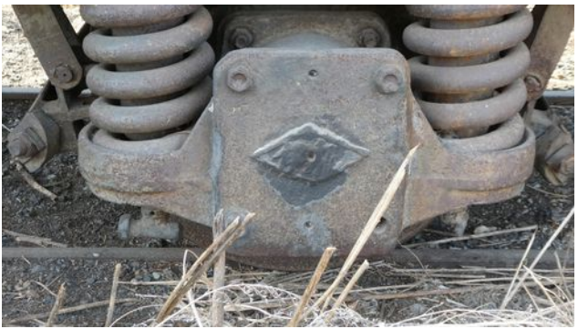
Maker's mark on an axlebox no longer legible. Does anyone recogonise this?