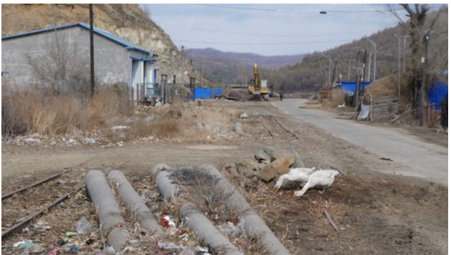
Tuoyazi looking towards Lishin