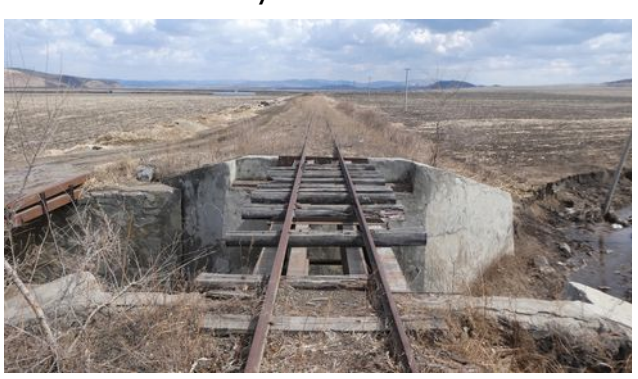
Another bridge needing repair