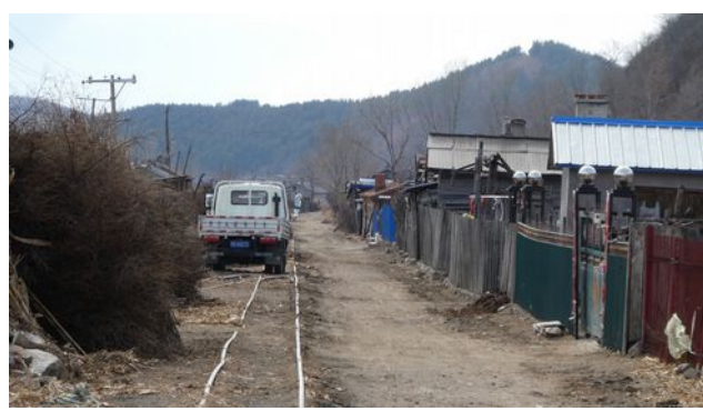
Tuoyazi looking towards Xiahua