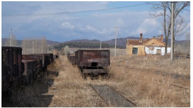
Coal wagon on old logging bogie