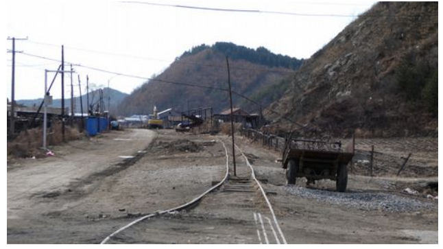
End of village towards Lishin looking back towards Xiahua