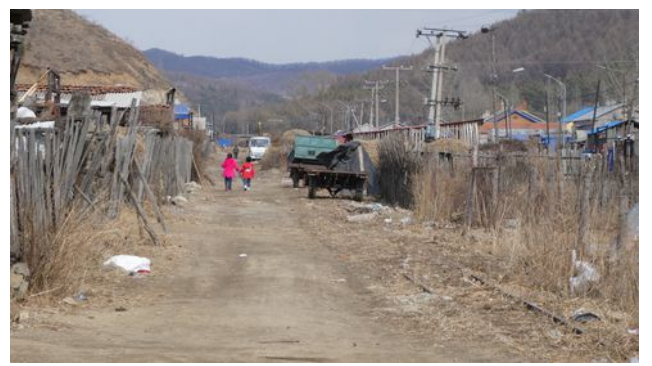
Tuoyazi looking towards Lishin