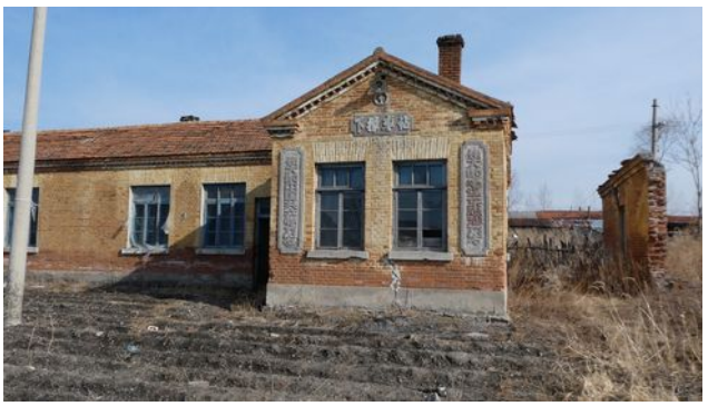
Elaborate station decorations