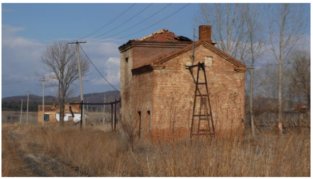
Watering point with the station behind Watering point - a Y goes off right here