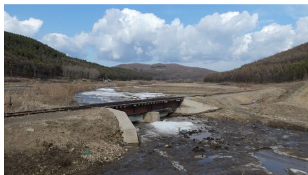
Bridge over stream towards Lishin