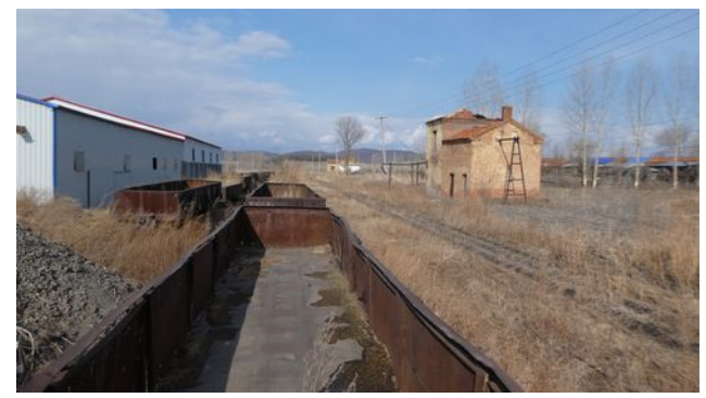
Old coal wagons (c. 30) and watering point