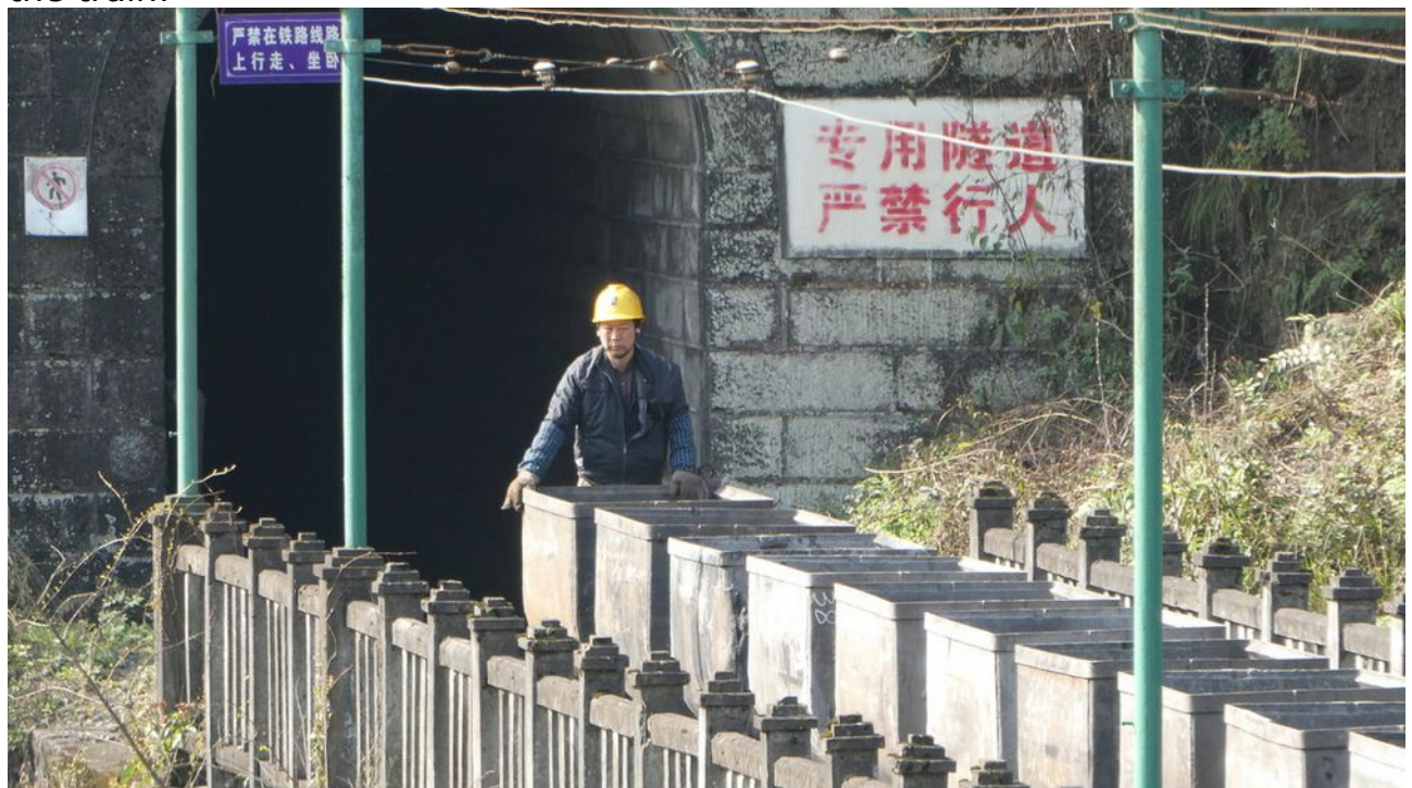
The man (sometimes a woman) on the back is a feature of all of these trains.