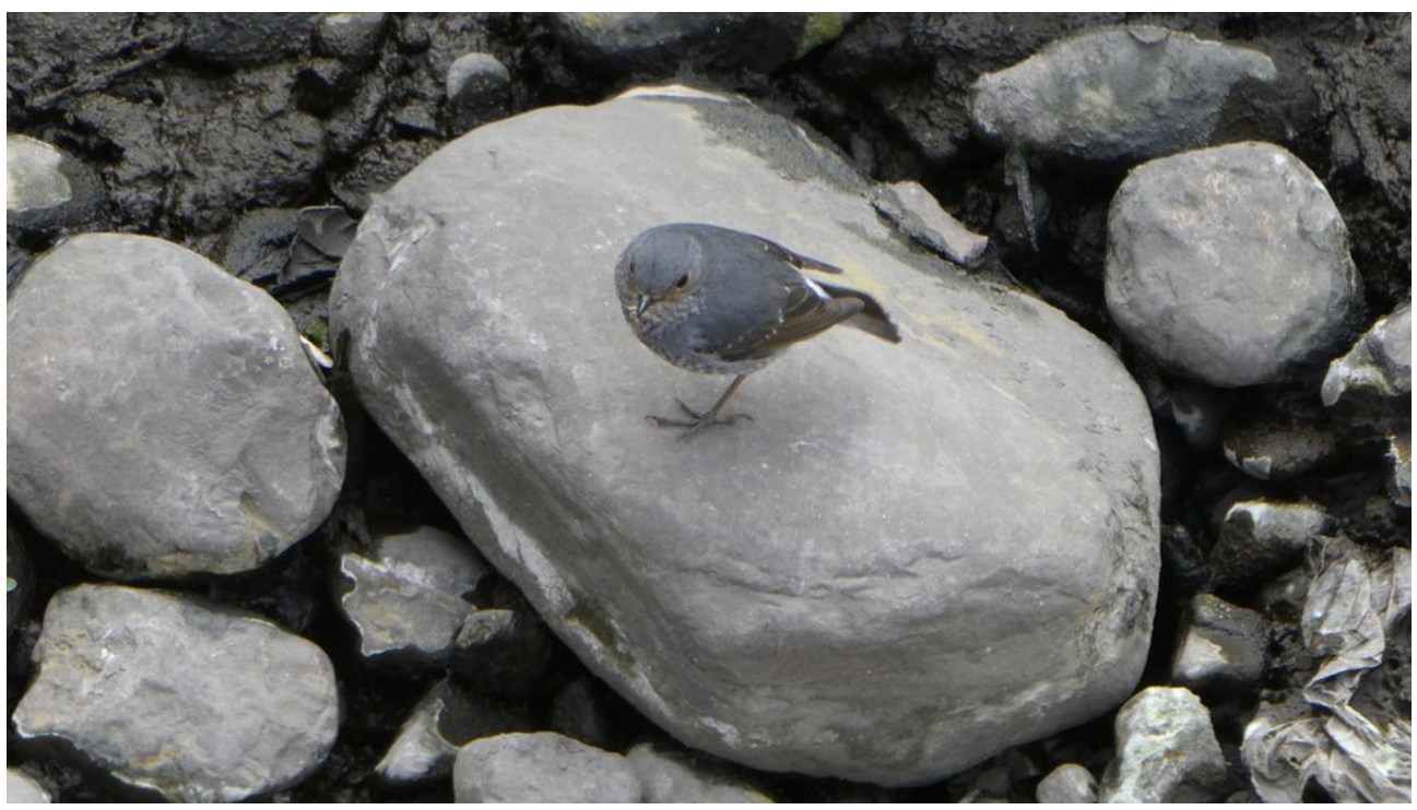
Something different - a female plumbous redstart.