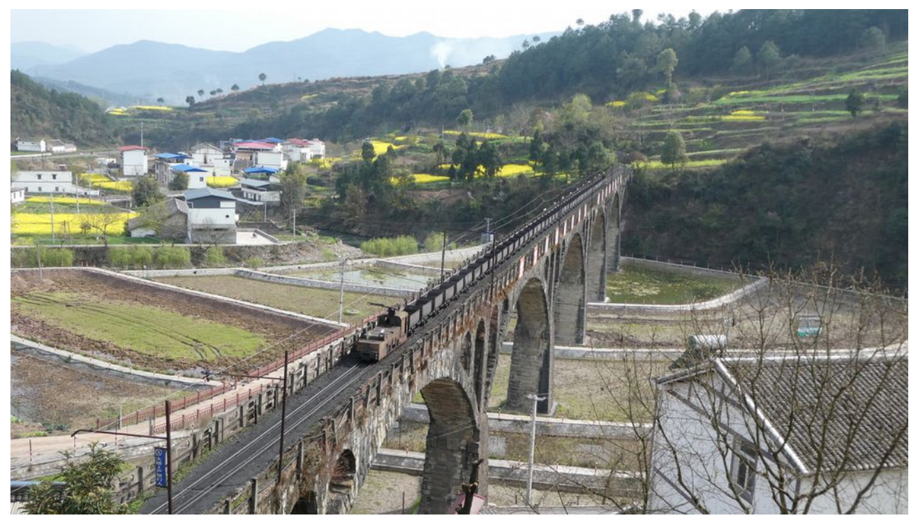
The same big bridge where we waited for hours without a proper train yesterday in nice light.