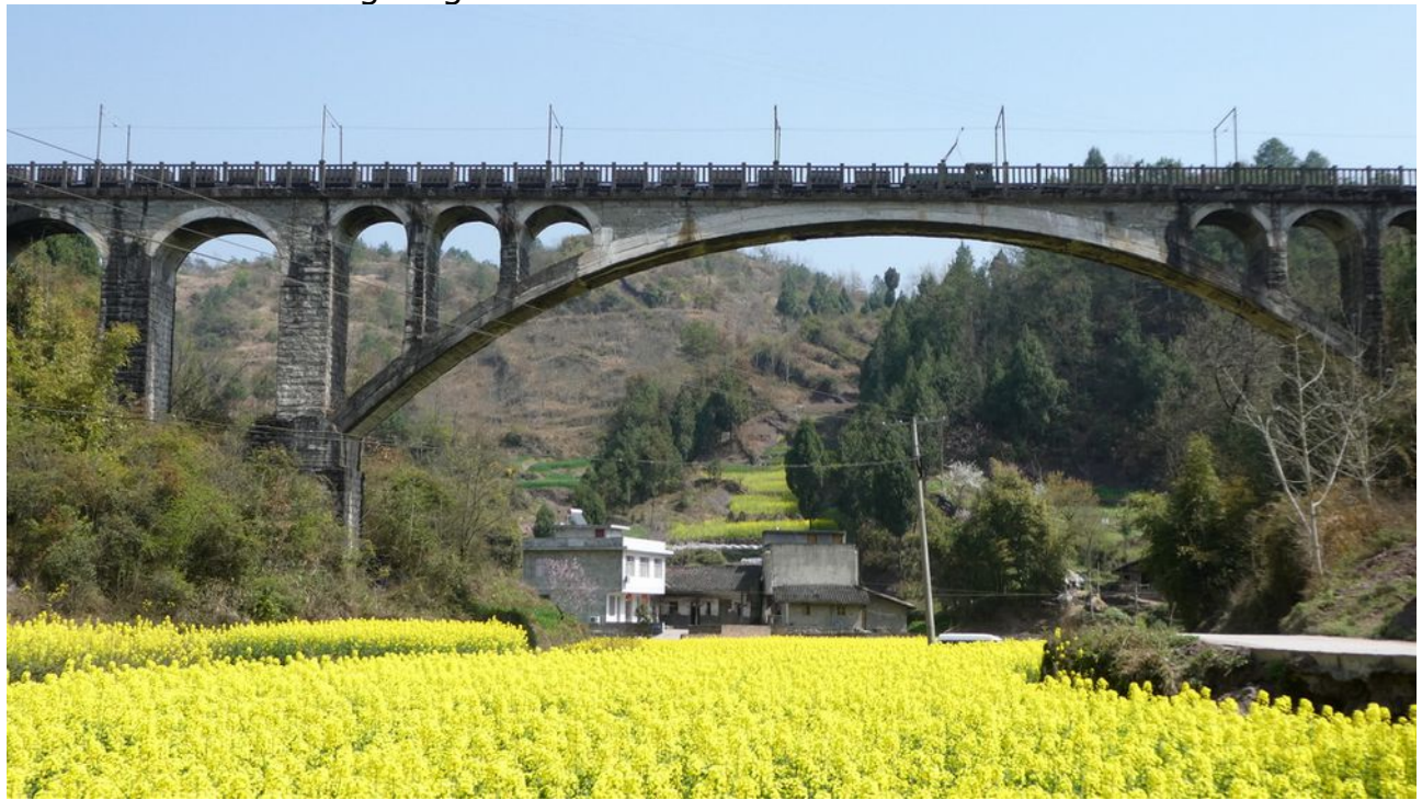
Another line, another big bridge. The empty coal train is visible but mainly behind the bridge railings.