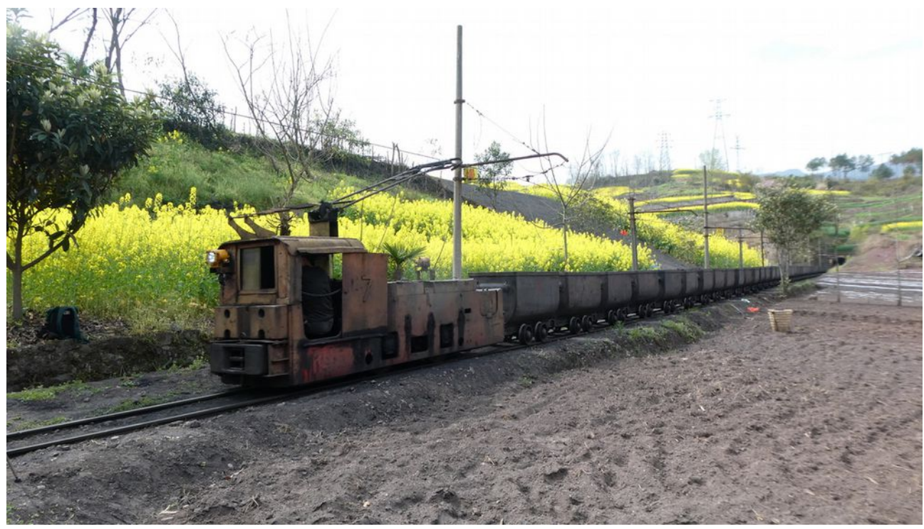
Coal on its way to the power station. The bank on the left is comprised of power station fly ash dumped over many years.