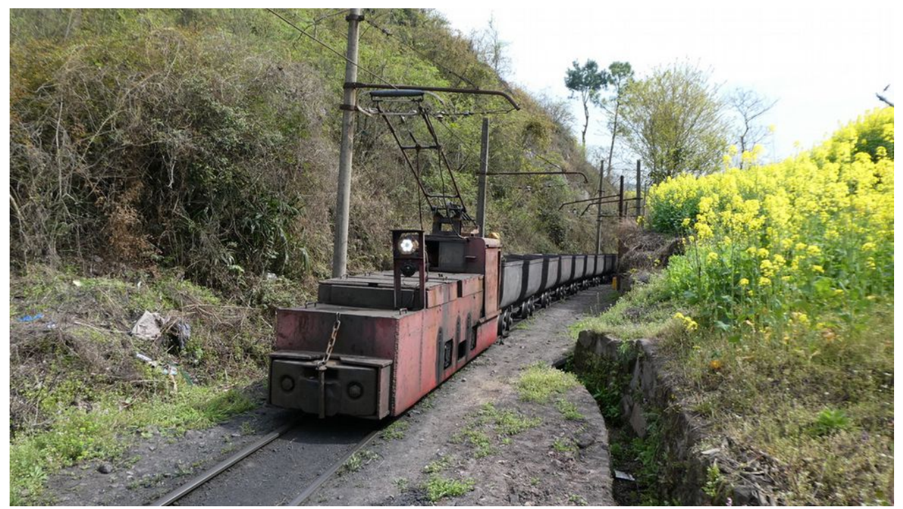
We returned to the line we visited yesterday. Three trains seemed to be in circulation at 15 minute intervals.