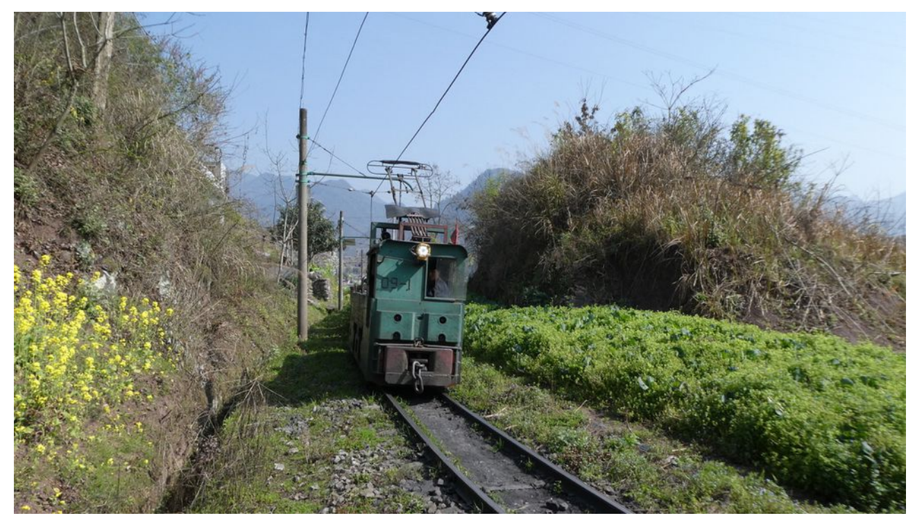
A coal train running down to the transhipment point.