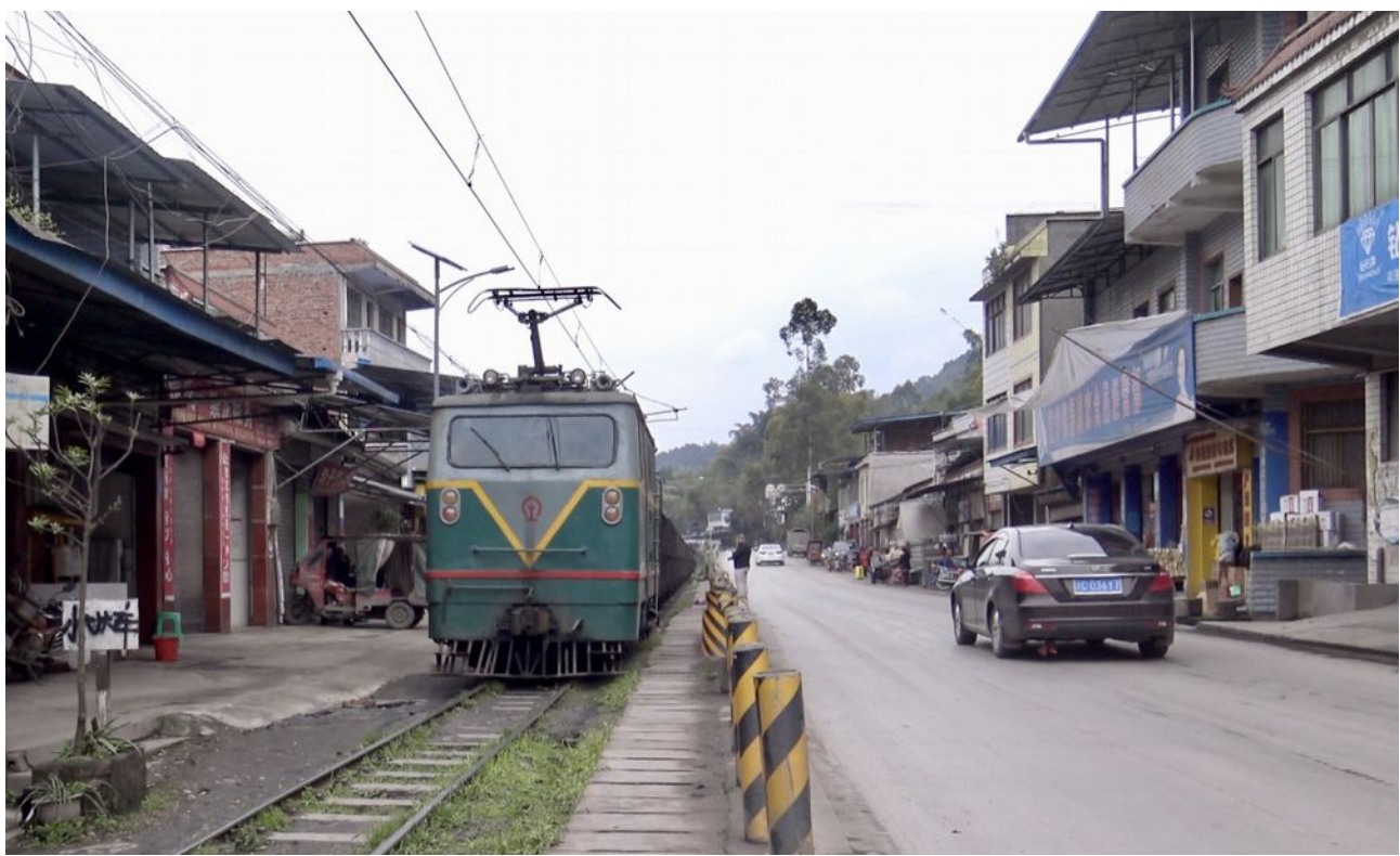
The alternative view of the same scene.