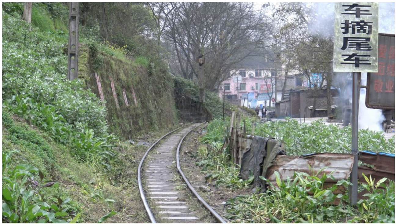
Looking the other way, this is truly the end of the line around Km 23.