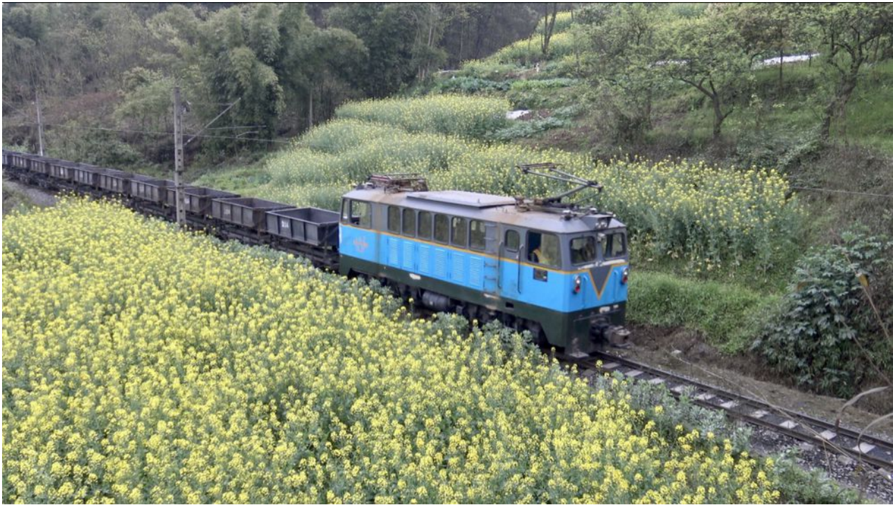
The new loco - unnumbered but possibly named - around Km17 on the section from Honglu to the mine.