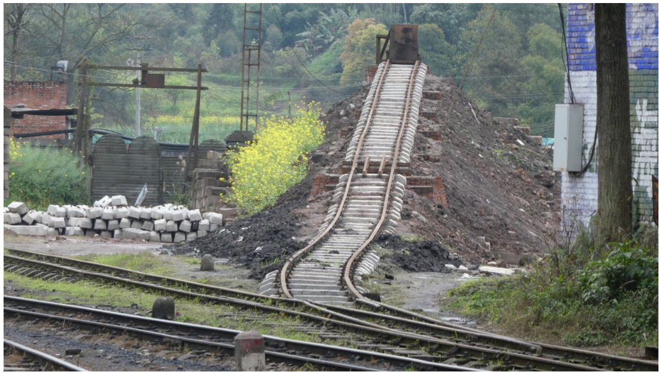
A newly constructed runaway ramp at Honglu. It may replace a previous version. The trains have only loco braking so this may be needed at times.