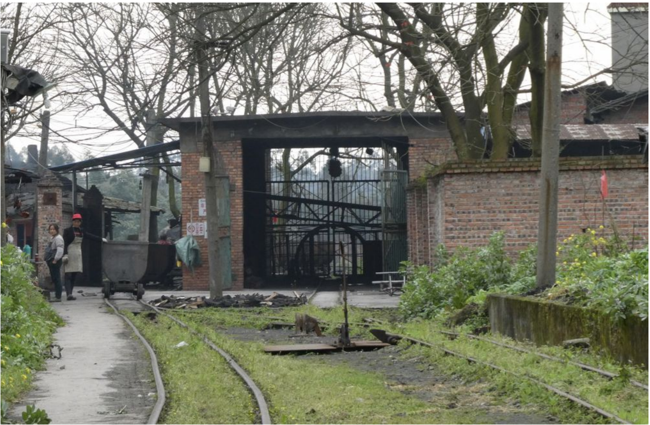
On a higher level there is a 600mm line formerly with overhead wires but now using a battery electric loco. The line runs for around 500m from the tippler shown to a works yard. Its purpose is not known but it is reported in daily use.