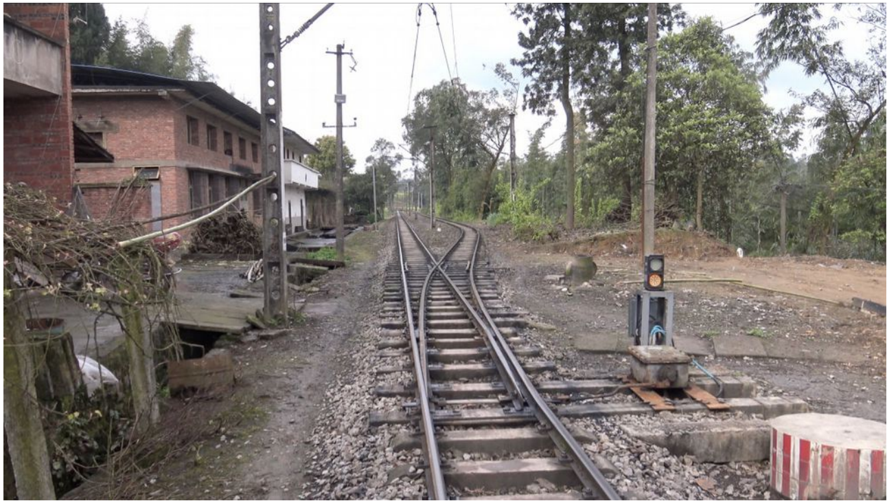
Full trains use the through line and empties go into the loop. This shot is looking towards Honglu.