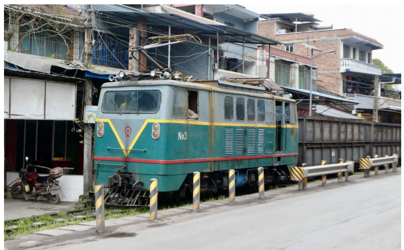
The first of two views of an empty coal train in Old Honglu.