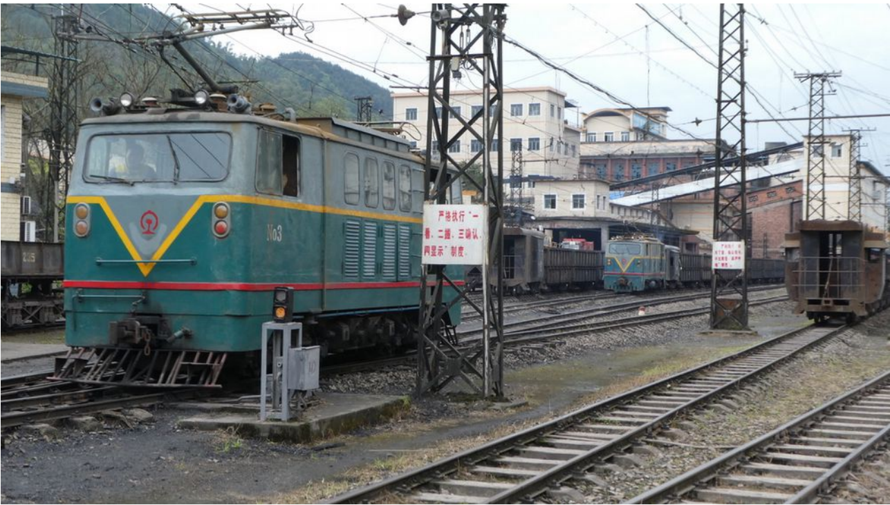
Two locos and two cabooses in the yard at Honglu. On the left a bogie caboose and on the right a 4-wheel version. The bogie versions are use on the section to China Rail.