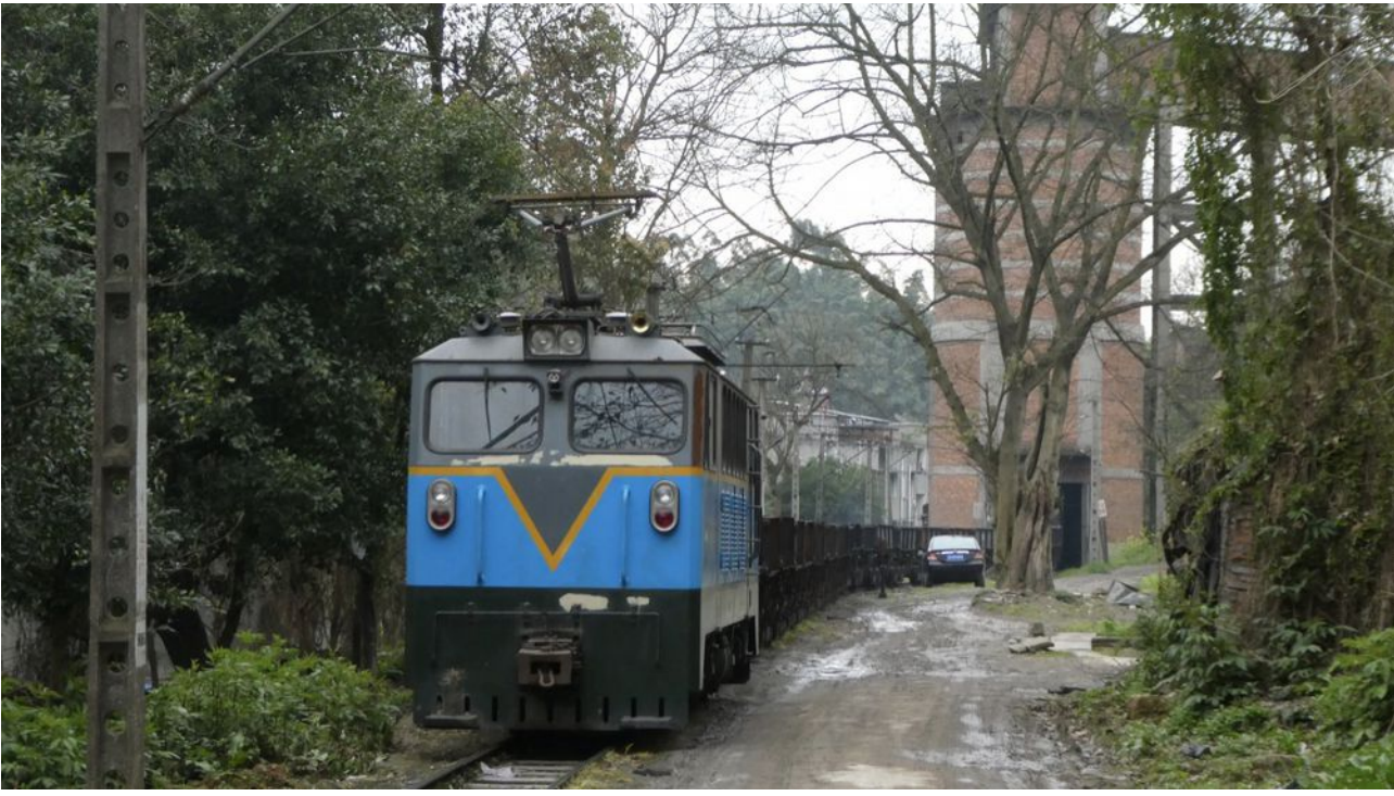
This is the modern coal bin at the mine.