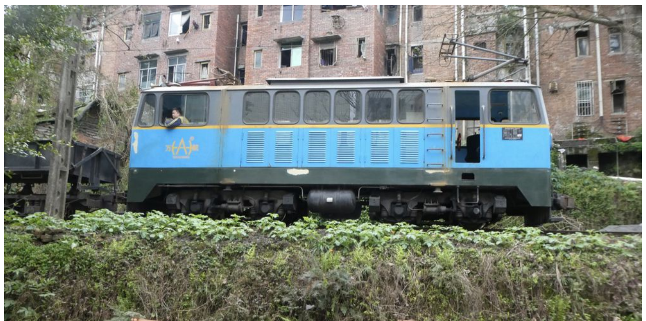
At the mine, the new loco propels the empties under the loading bin.