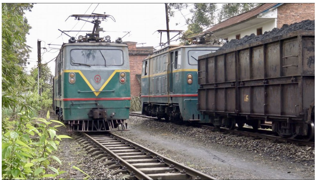
Tour Day 8 Yongchuan Coal Line - Honglu Part 2

This is the crossing point on the lower section of the line from Honglu to the interchange with China Rail. We walked this section of the line which is remote from the road.