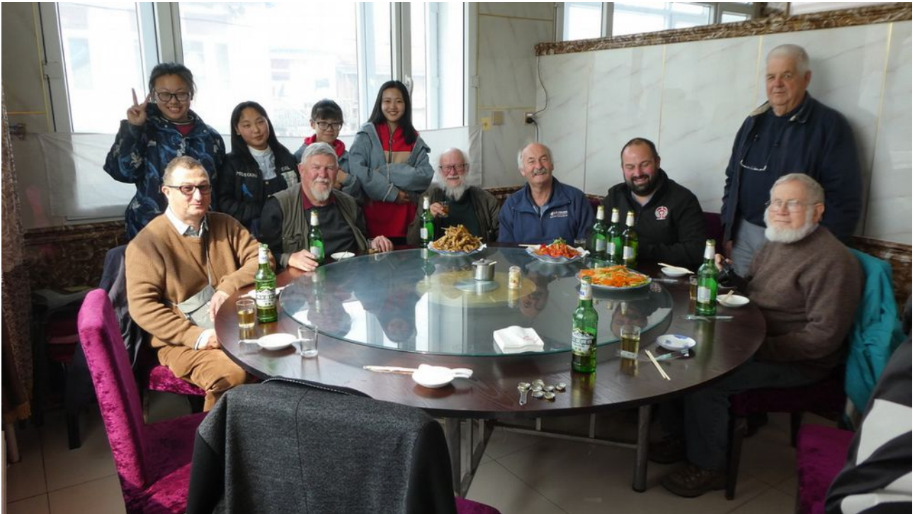
Our group were discovered by some local girls looking for selfies with the western visitors.