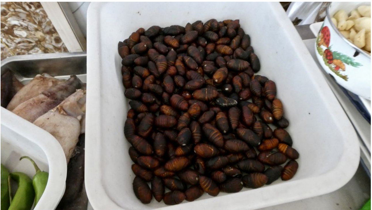
Silk worm cocoons were on the menu for lunch so after checking if some of the group would try them, we ordered up a plate.