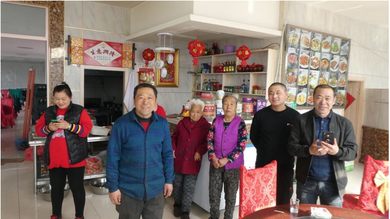
The family who run the restaurant. The young cook and owner is second from right.