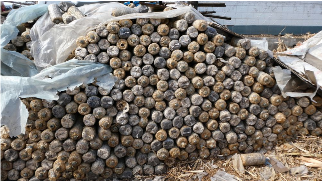
These looked odd so I asked what they were. It seems they are used to grow fungus after being impregnated with fungus spores.