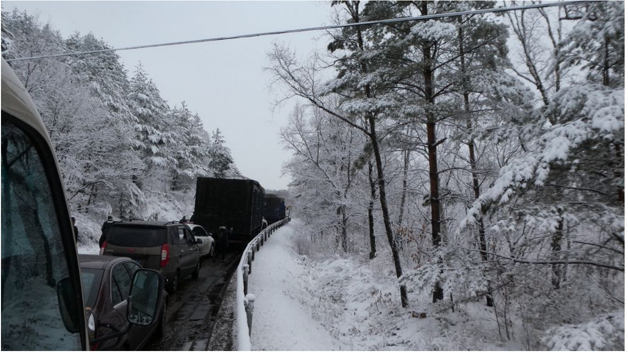
This was the view looking forwards.