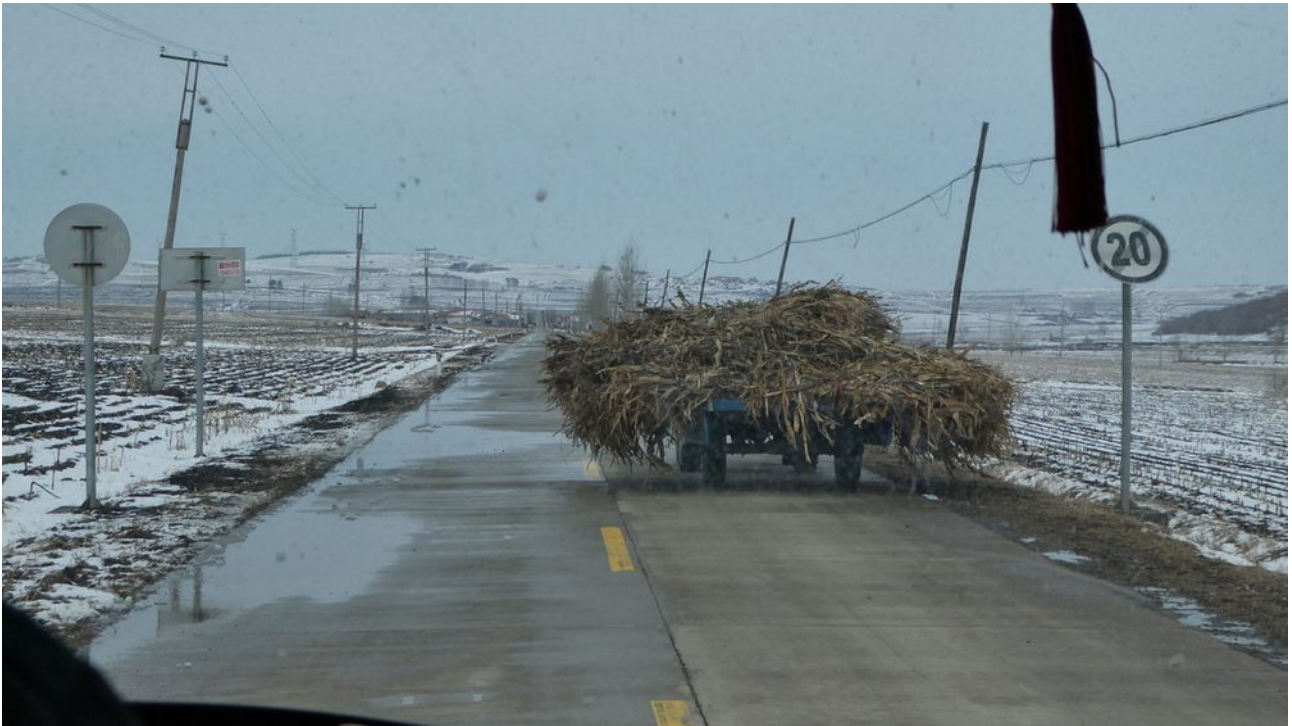
We got onto a good bit of road after Qitaihe but overtaking was a squeeze!