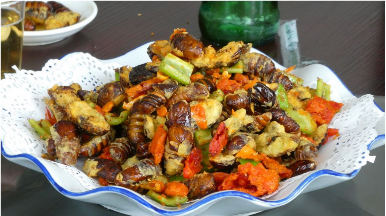
Silk worm cocoons prepared as a dish. They were tasty.