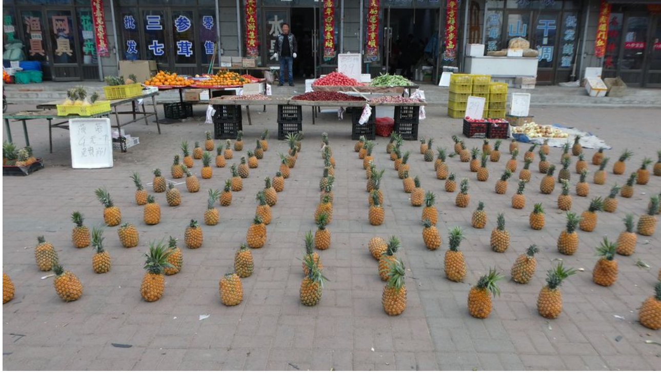
...pineapples, to place on the tombs.