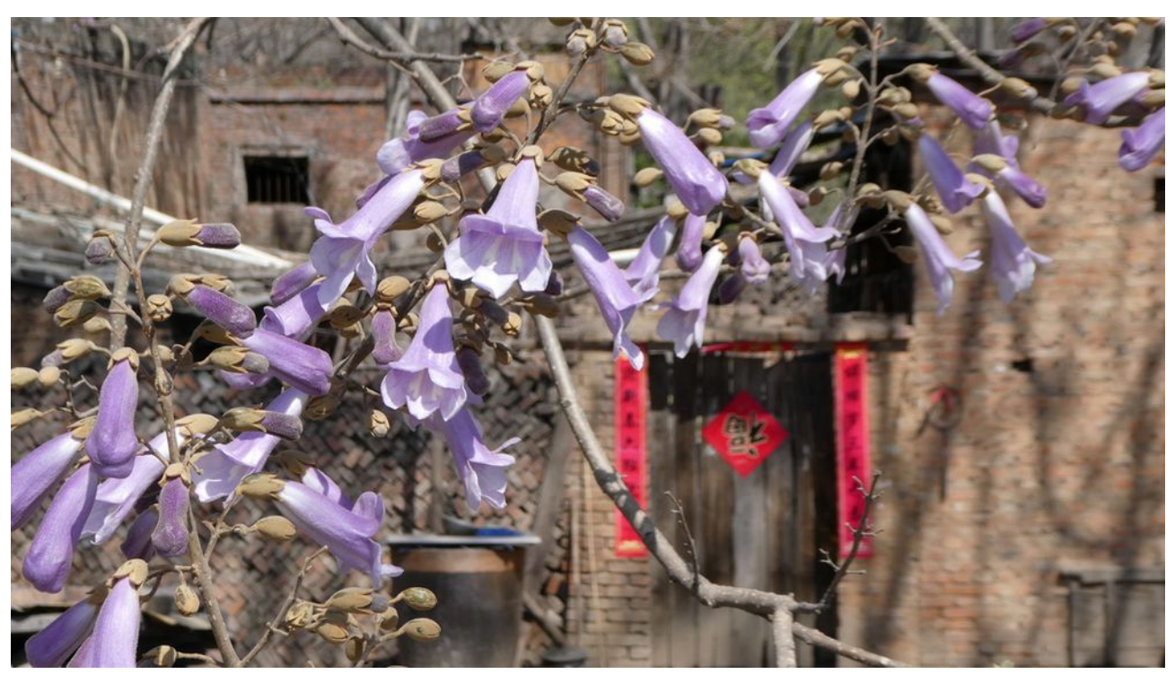
Blossom in front of a doorway decorated with Chinese New Year signs near the Yujian Railway, Hunan. I don't think this is magnolia but what is it?