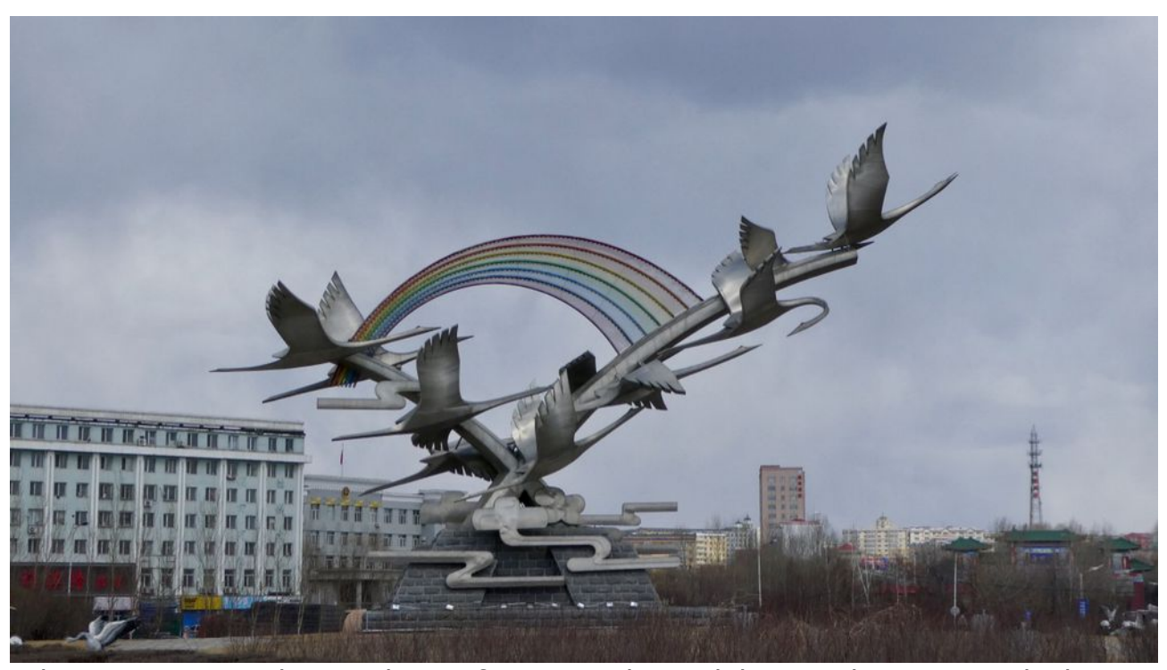
A large statue on the outskirts of Hegang that celebrates the cranes which overwinter in Japan and Korea and return to Hegang in the summer. They are the national bird of Japan and appear of the Japanese ¥10,000 note.