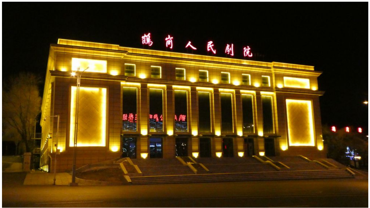
Hegang People's Theatre opposite our hotel at night.