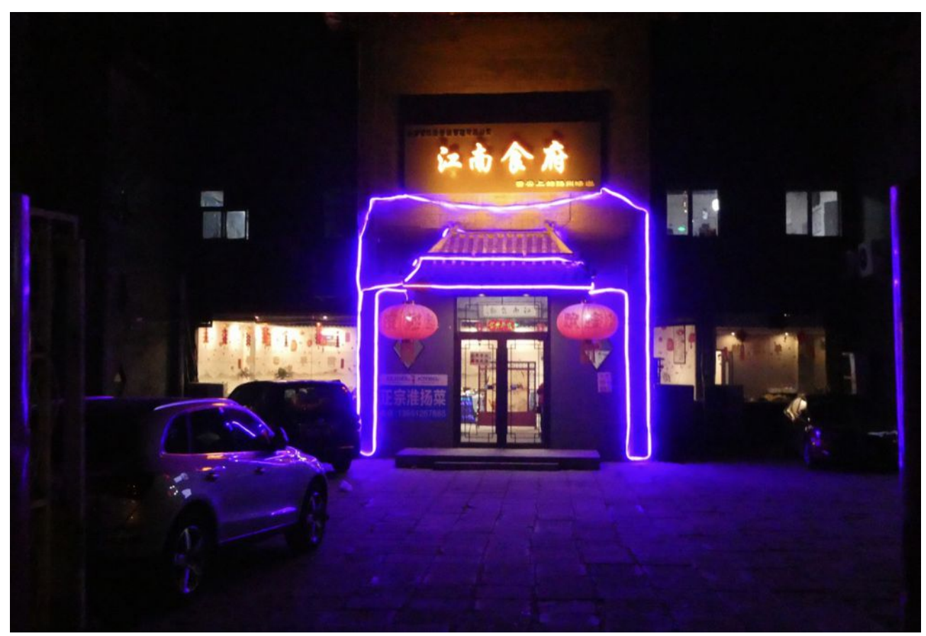
Night view of our restaurant near Beijing Airport.