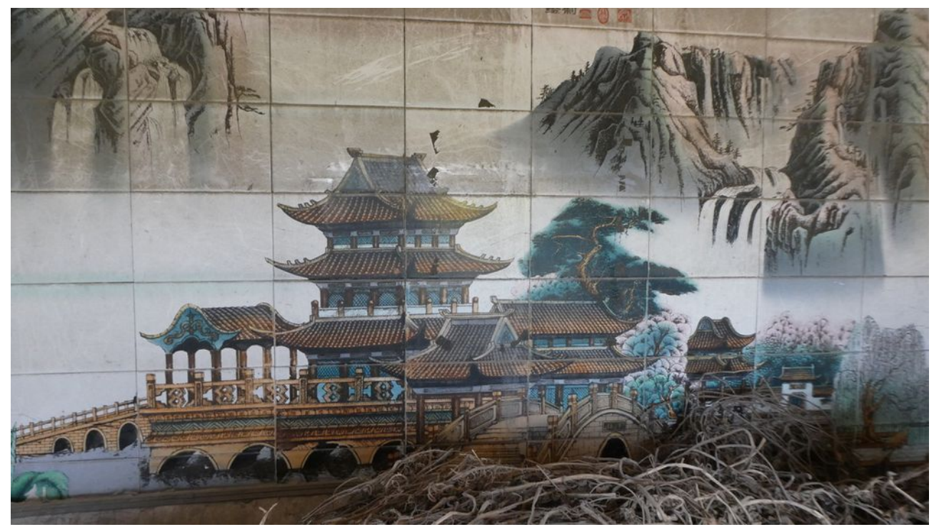
Attractive tiles in a house abandoned due to coal mine subsidence near the Yujian Railway, Henan. It would have been interesting to see the lower section but this was obscured by cattle feed.