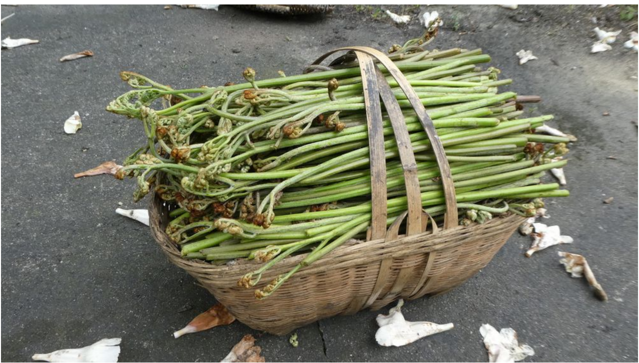
Wild young fern shoots collected for the kitchen.