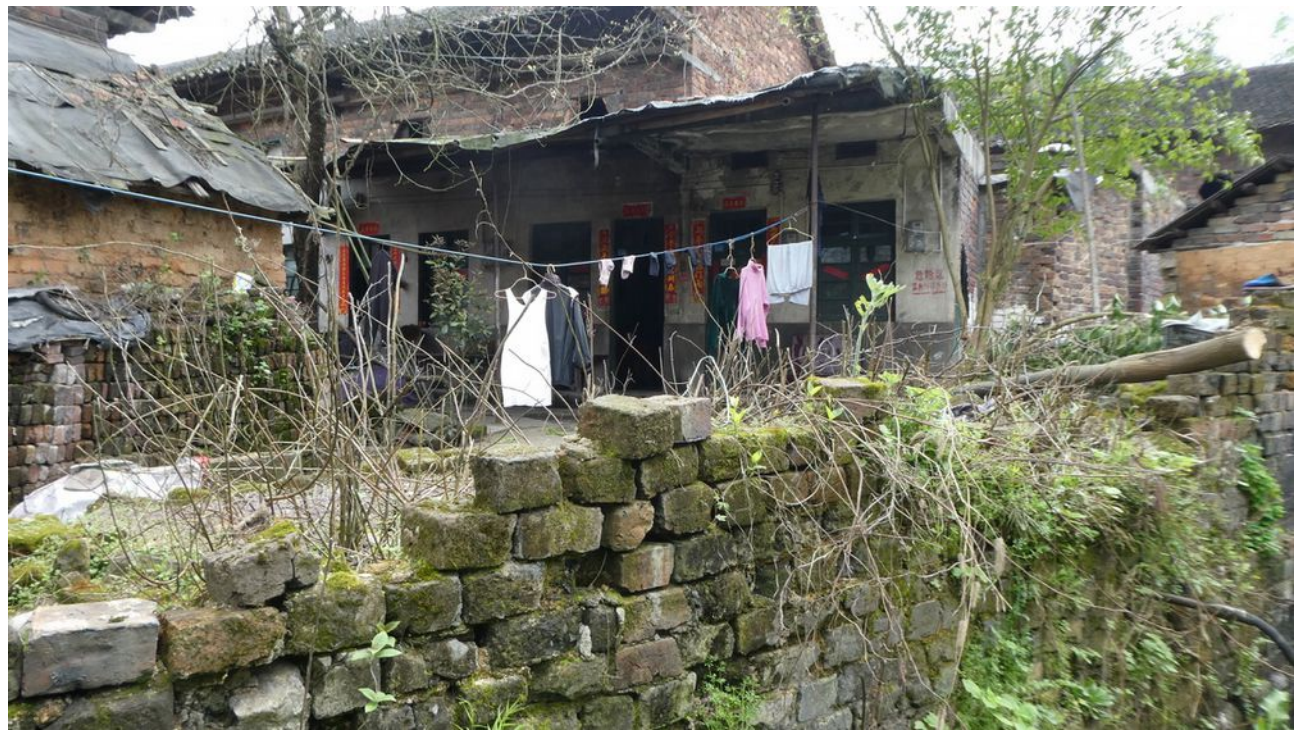
A simple run-down house in a terrace of single storey houses.