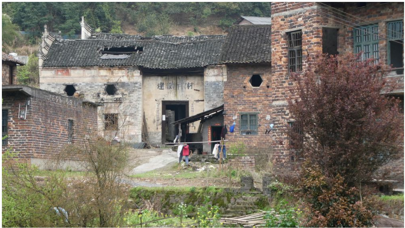
General view of abandoned buildings and others still in use.