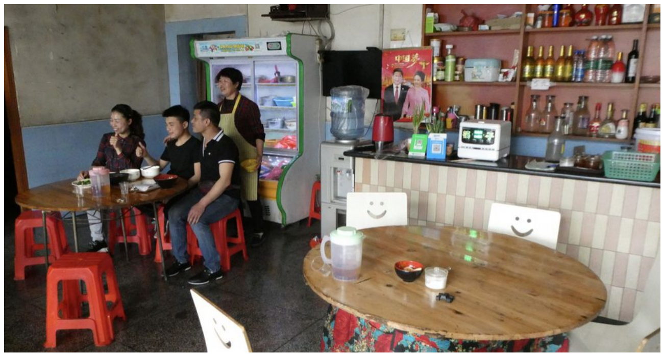
Our restaurant for lunch. The staff are posing for photos for other group members while this photo shows a more general view of the restaurant.