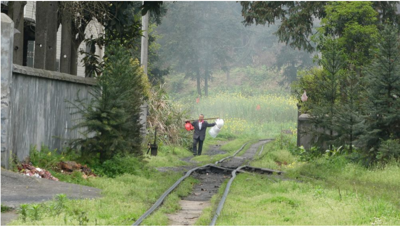
The narrow gauge railway is still a thoroughfare.