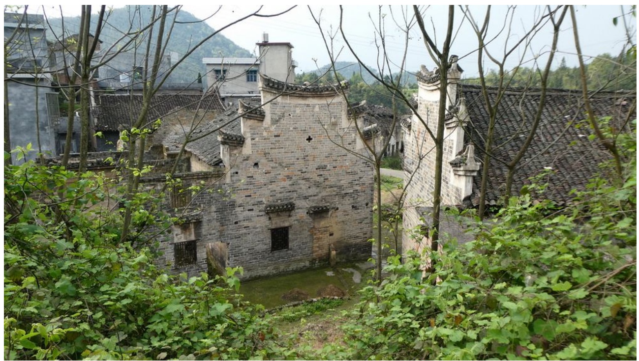
Old houses mainly abandoned.