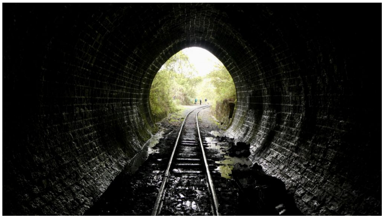
View out of one of the muddiest railway tunnels I've ever walked through.