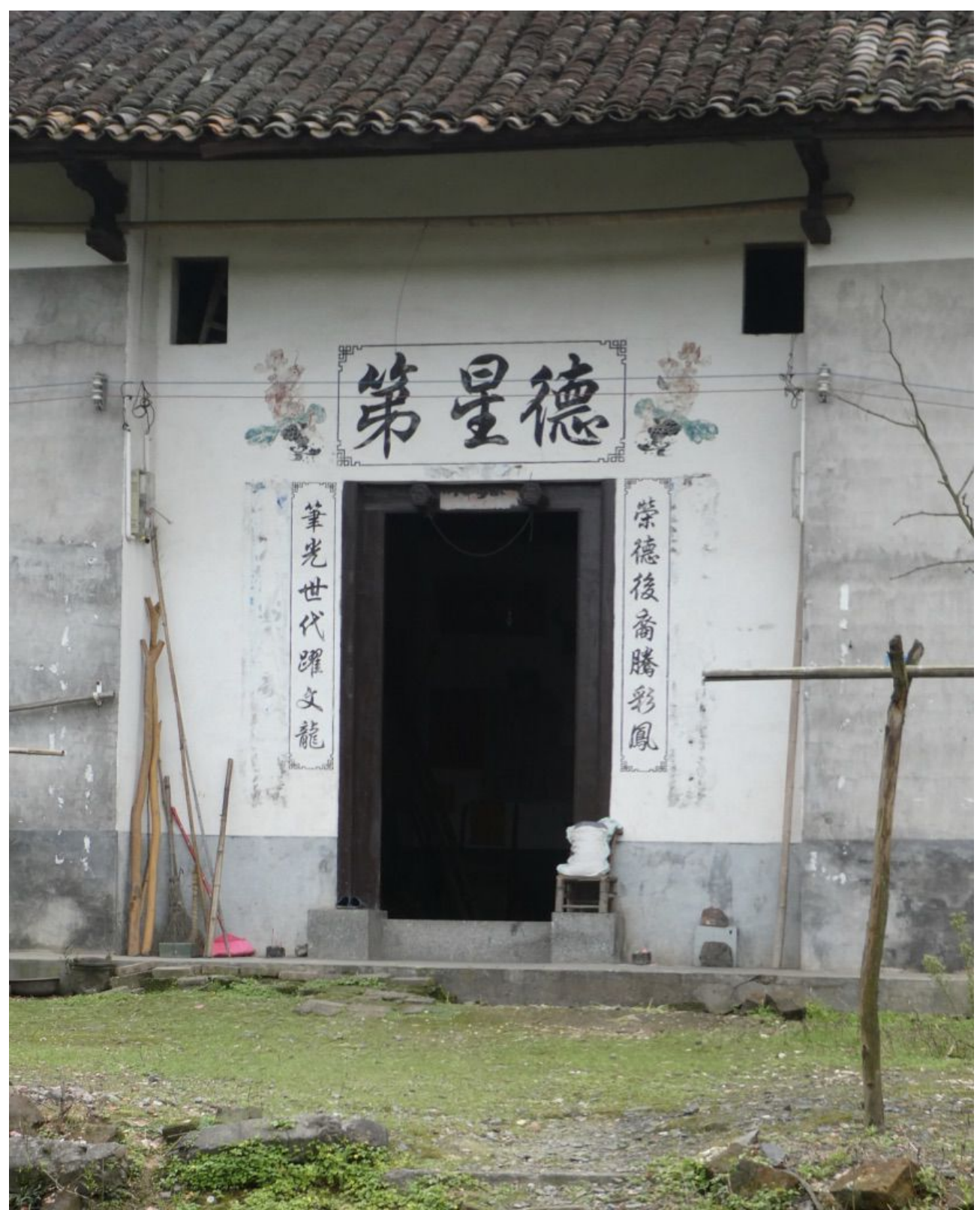
(Top) Conduct star number? written right to left (left and right) These defy easy translation - includes old characters The house of a 'learned man'.