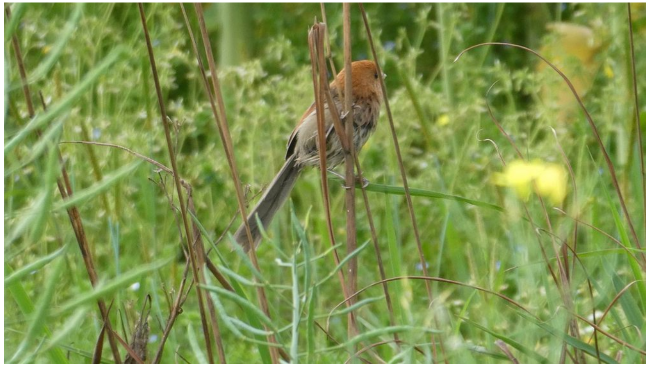
Common bird as yet unidentified.