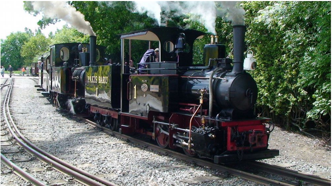
Statfold Barn 2013 - dual gauge track and ex-Pakis Baru No. 1 and No. 5 on the 2ft 6in line. Both locos now consigned to the museum (1 June 2013)

Once we are free to travel around and once the UK preserved railways resume operation, I will be keen to go to Statfold Barn, the North York Moors and my local Lincolnshire Coast Light Railway where I volunteer. All of the preserved railways everywhere will need our support and cash as they attempt to recover. I would also like to try to re-arrange a private trip to Ireland as the Irish peat railways are likely to be severely reduced at the end of 2020 with the closure of two peat-fired power stations and their associated peat bogs and railways. If it is possible to go there in autumn 2020, I would like to do that.