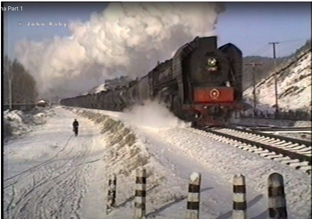
Screenshot from LCGB China Nancha Part 1

https://www.youtube.com/user/trundlebahn/videos