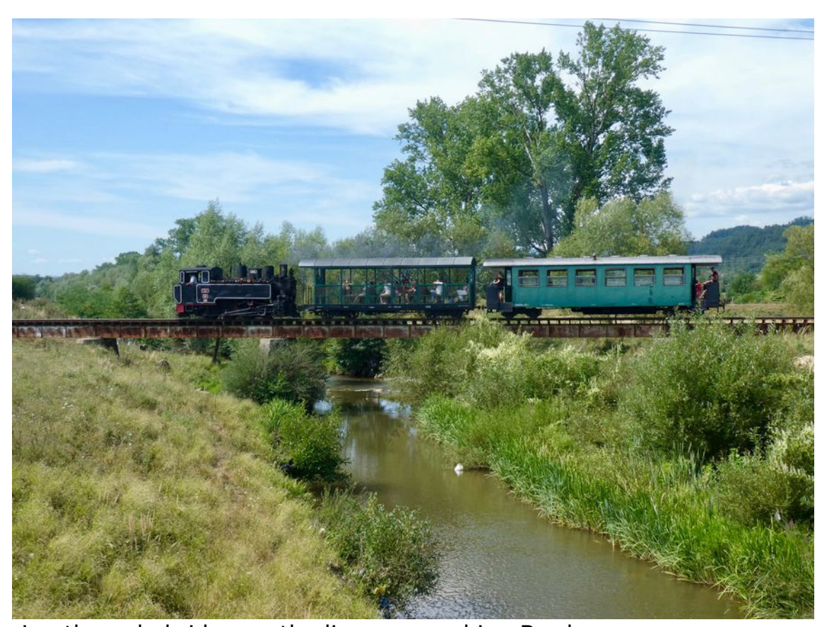
Crossing the only bridge on the line approaching Brad.