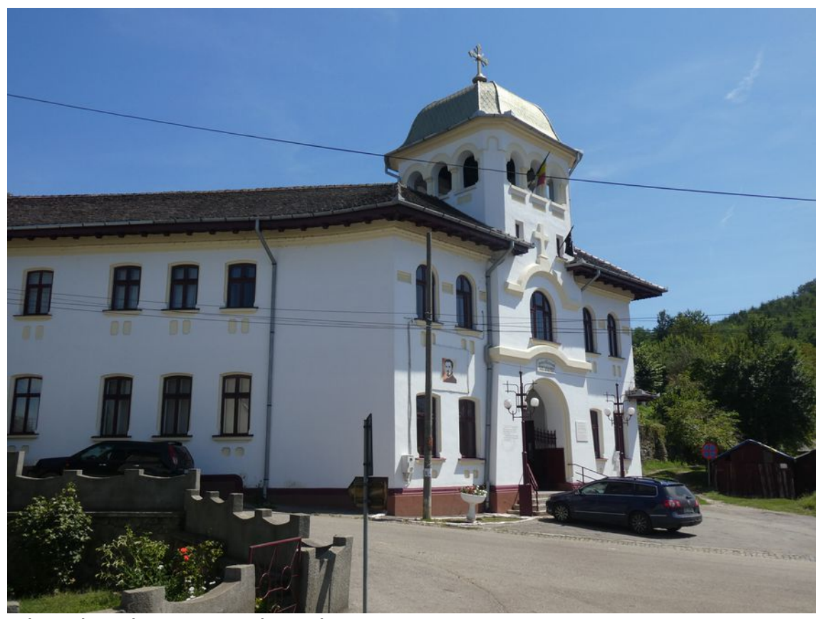
Orthodox church near Brad on the train route.