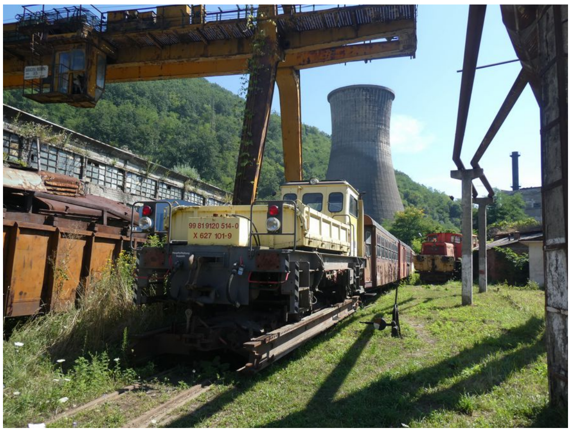
In the shadow of the cooling tower for the town central heating plant, among other things a standard gauge track vehicle on a narrow gauge transporter wagon.