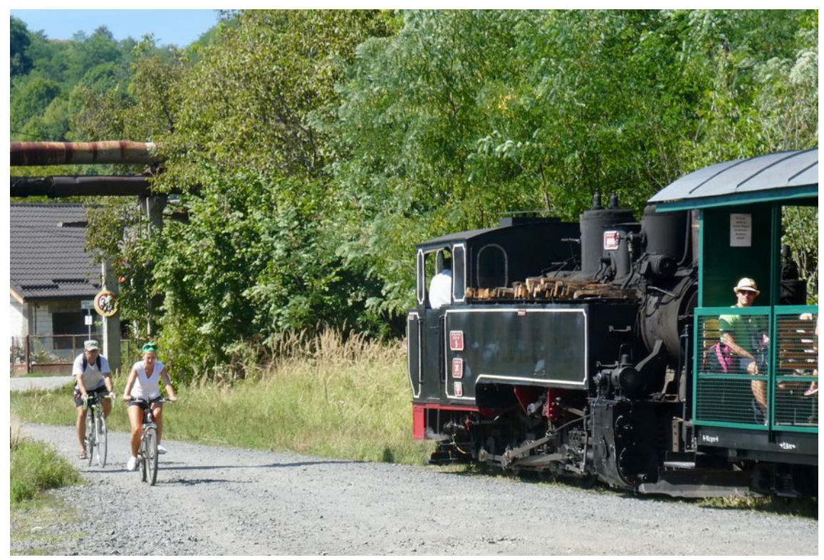
The second return working leaves Criscior.