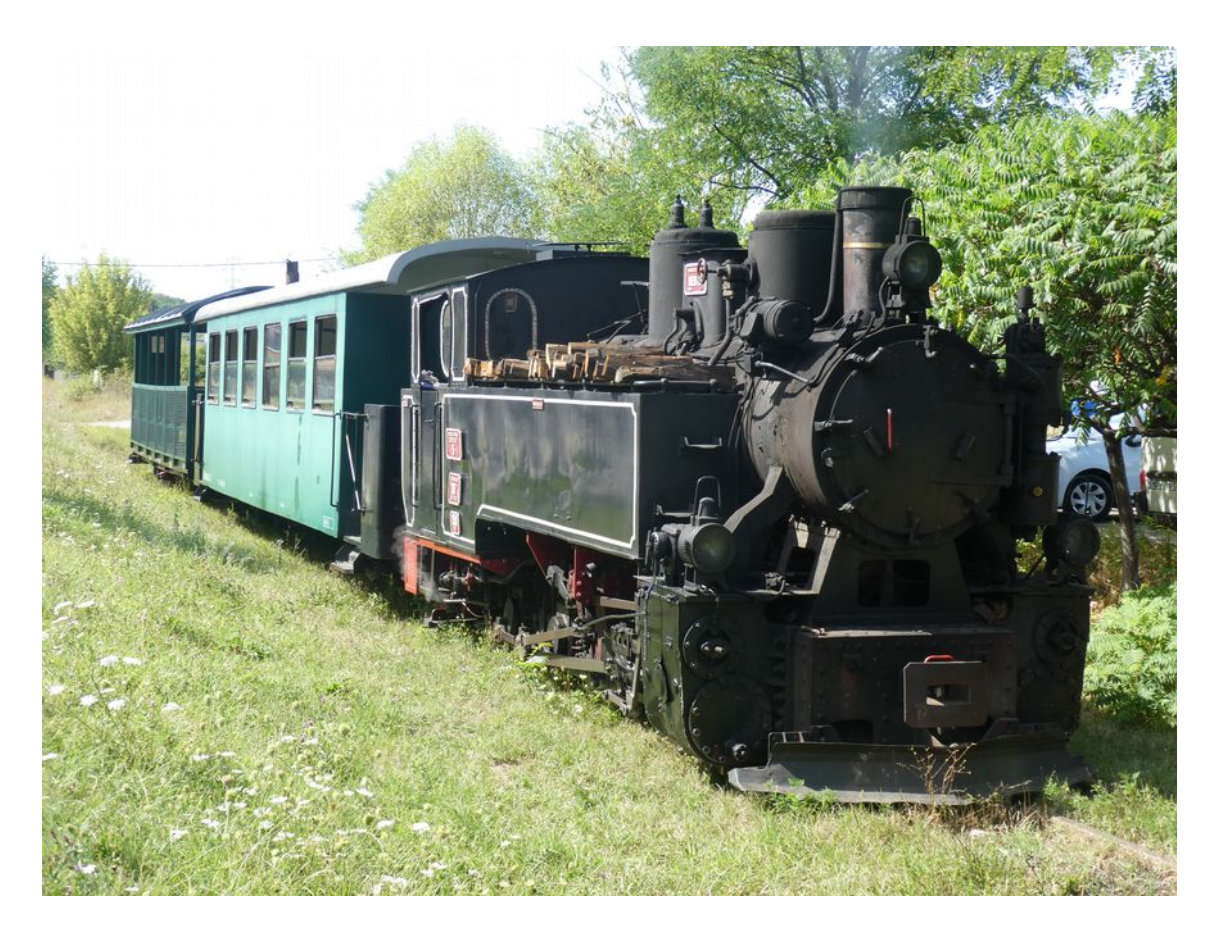
At the Brad end of the line at the former standard gauge station and standard/narrow interchange.

Two shots of the second return working at the church. I couldn't decide which shot I like best so I've included both.