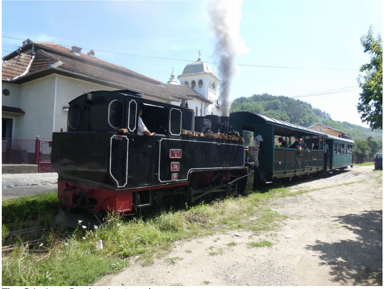
The Criscior - Brad train stops here.