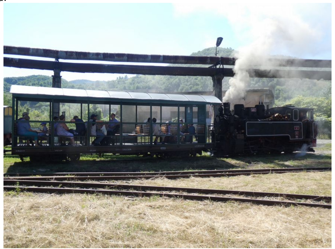
Waiting to depart Criscior.

After the tour, there was just time to eat our packed lunches before our train departed. The following shots are of the two tourist train return workings to Brad.