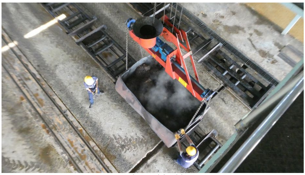
Cages being lifted by crane