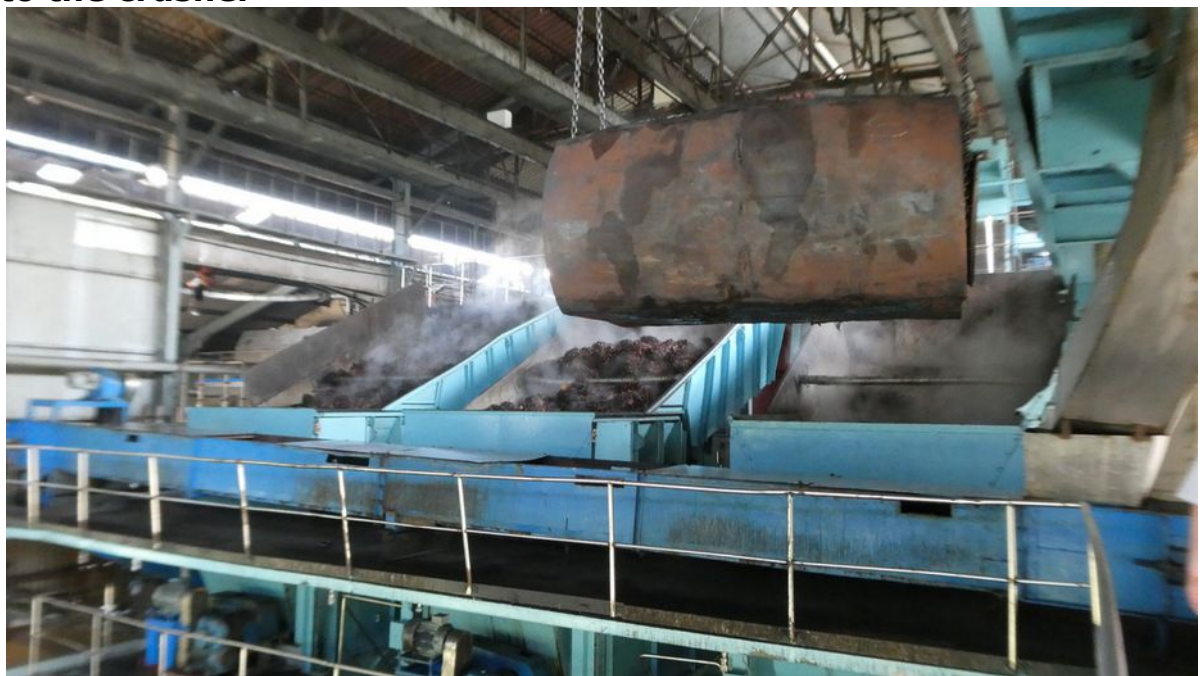
This cage has been lifted off its frame to be emptied into the crusher

There are variations in the process Rotary tipplers or removable cages Cages from the field direct to the steamer or dedicated steamer cages