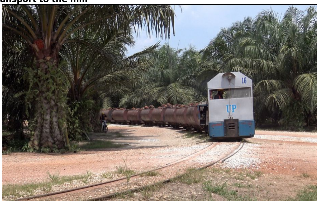
Simplex No. 16 starts its journey back to the mill