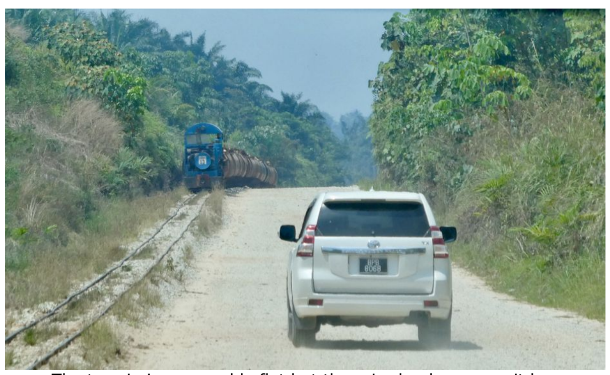
The terrain is reasonably flat but there is clearly a summit here