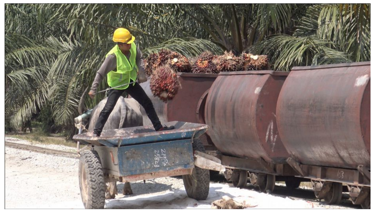
Transferring bunches manually