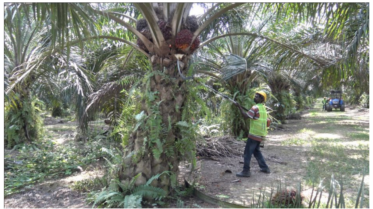
Using a Stihl motorised knife to cut the bunches