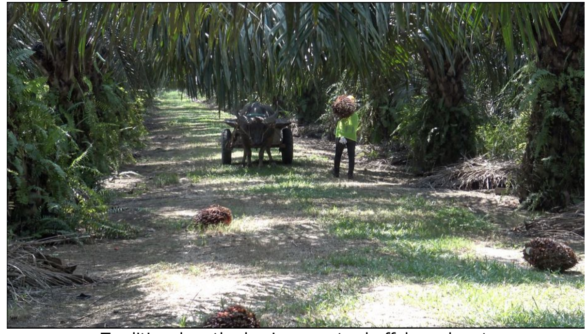
Traditional method using a water buffalo and cart