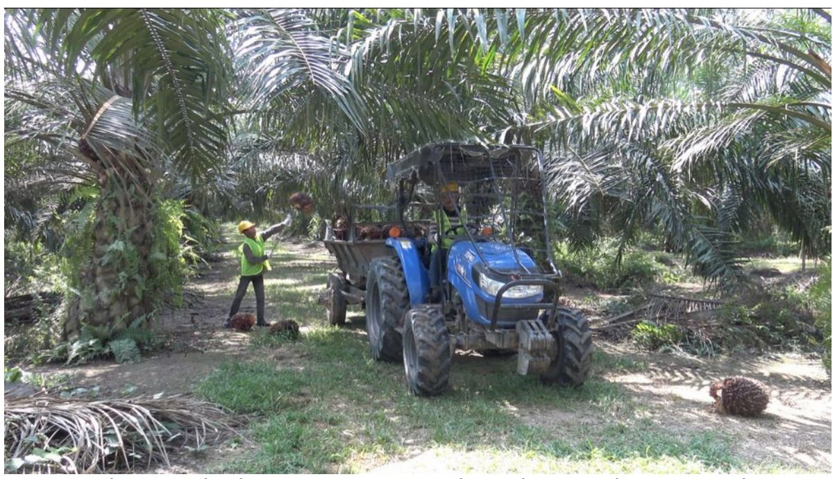
Modern method using a tractor and an elevating/tipping trailer