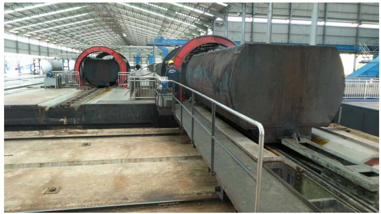
These larger cages are tipped using the rotary tippler