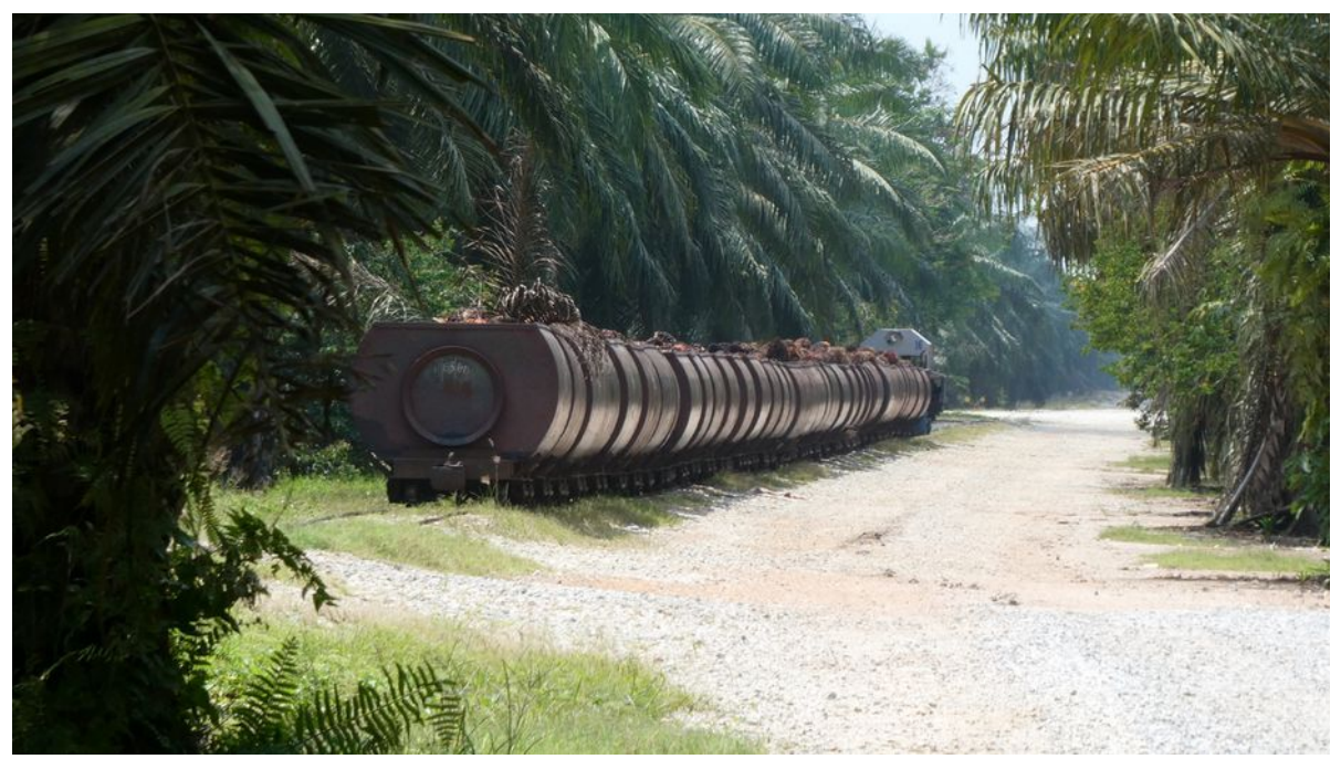
En route to the mill with around 40 cages