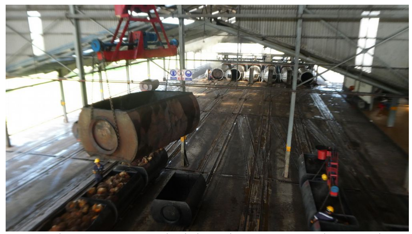
Several cages at a time are loaded into the steaming vessels seen in the background to make it easier to extract the palm oil