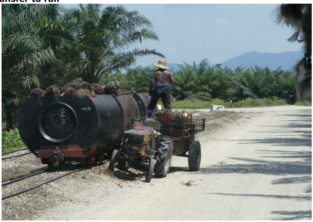
Transferring bunches manually into the rail cages.