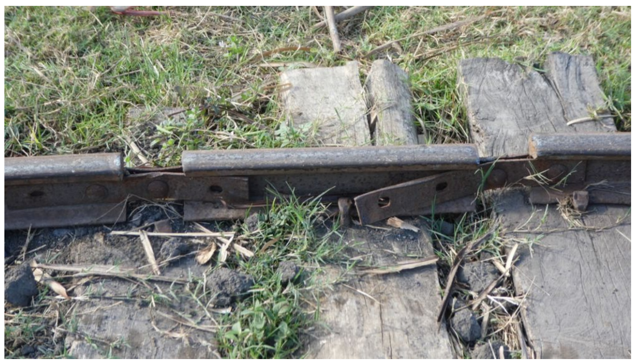
You can probably spot at least 3 things they got wrong here!

The state of the track has raised a comment or two. I think we need a new category of bad joints along with the existing category of bad track. Here's a classic.