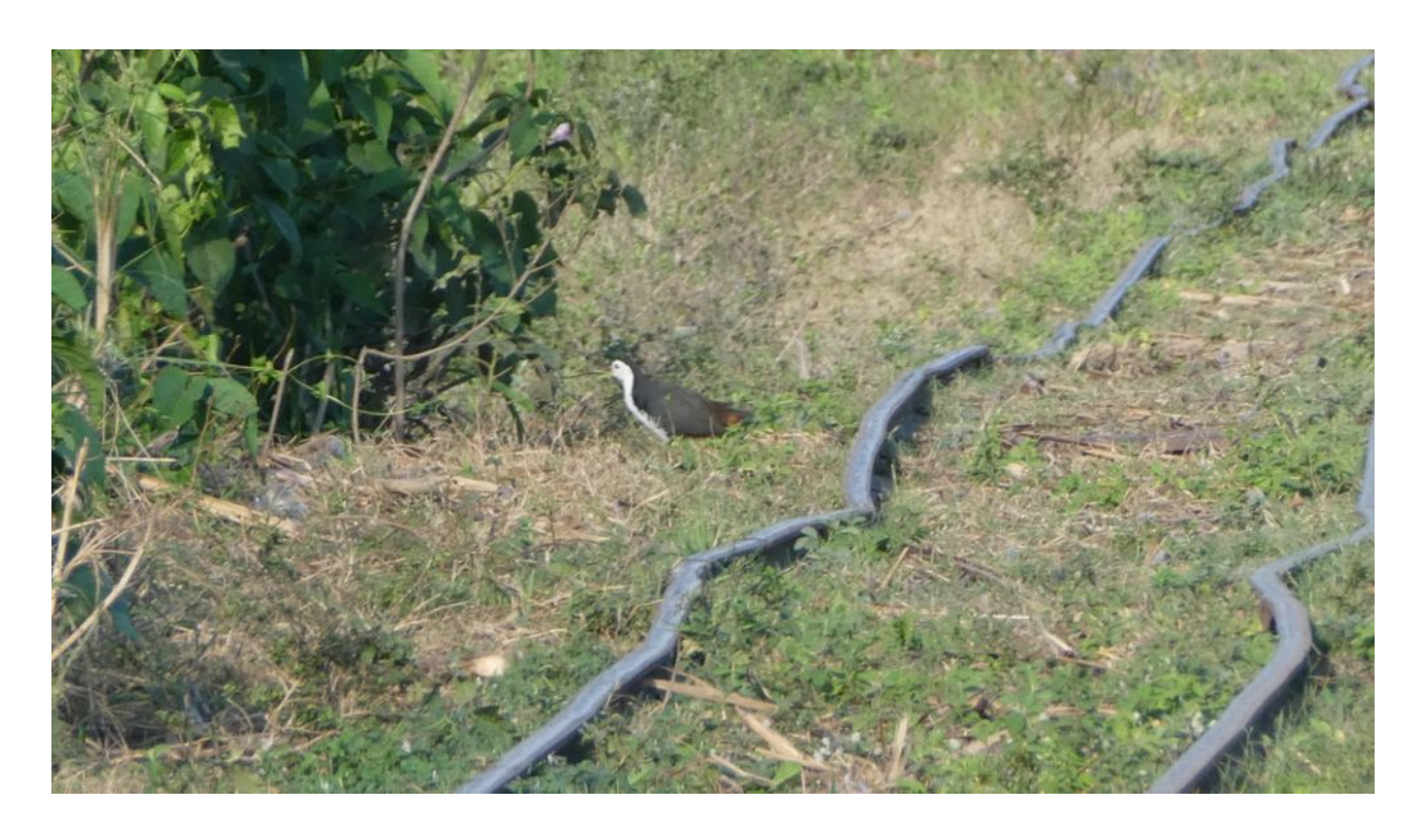
I'm sure that the maximum telephoto makes the track look worse than it is! I saw trains run along this this afternoon without derailing.