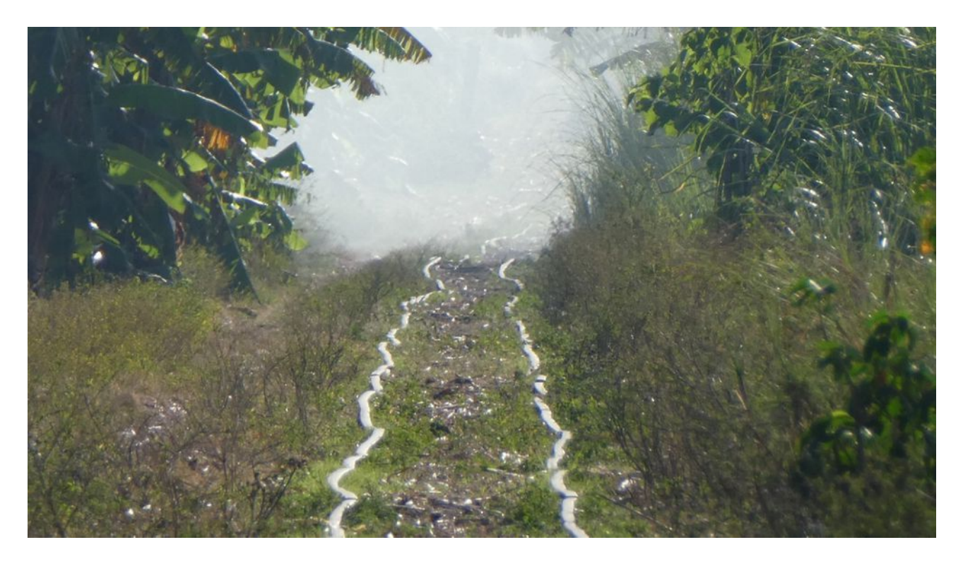
And how about that? I'm sure that the track is perfectly OK, it's just the effect of zooming in on it!

The little diesels look quite at home in the fields and although it's not steam it's still a pleasure to see narrow gauge (700mm) trains in the cane fields in 2017.