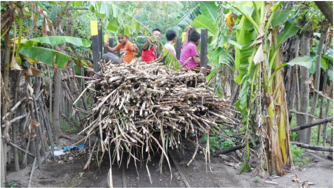
The boys had chosen to ride on the last cane wagon.