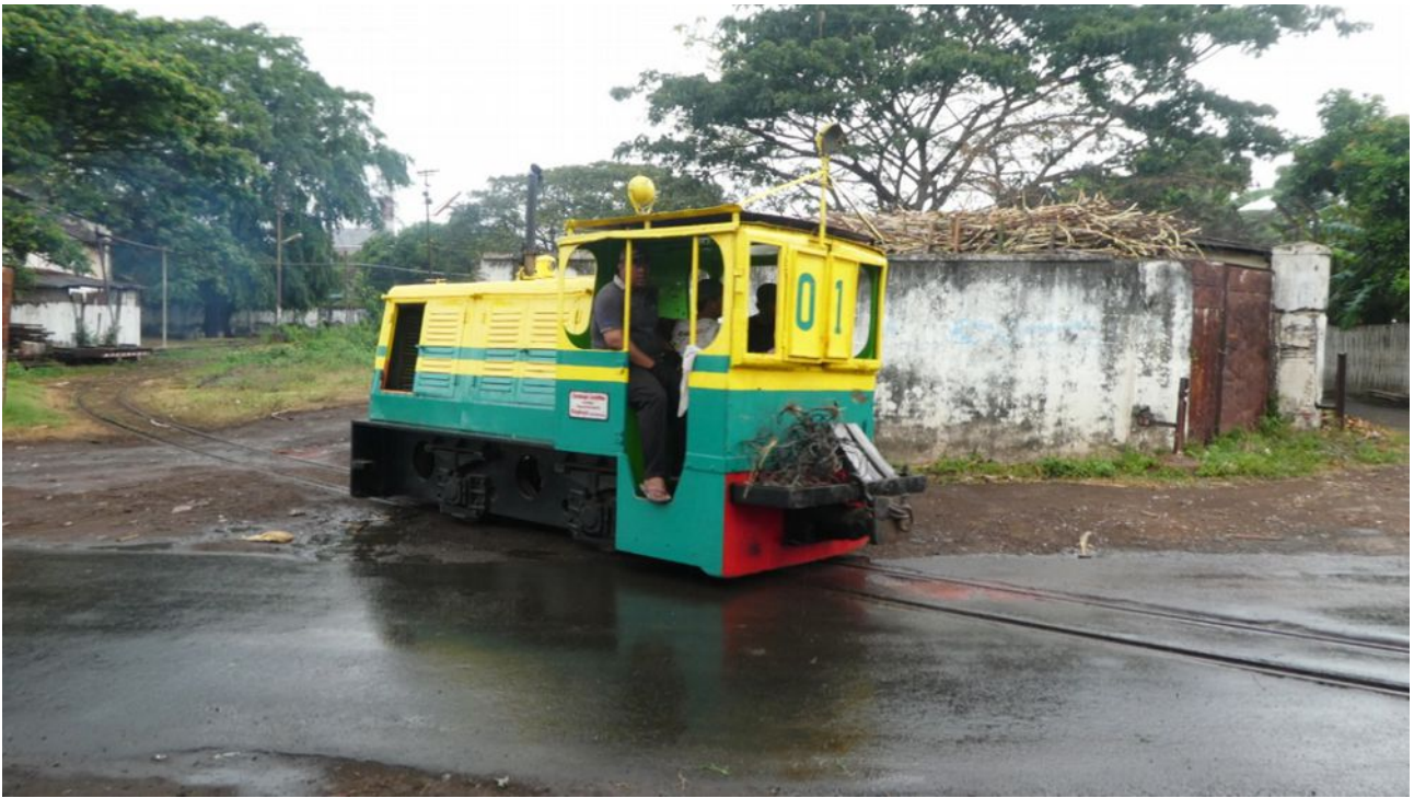
Followed shortly after by No. 1.