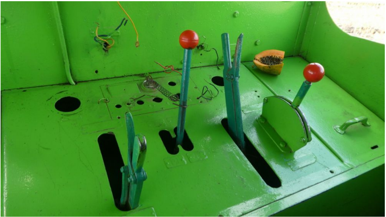
The hand controls are simple with forward/reverse, gears, brake and accelerator with a foot clutch down below.