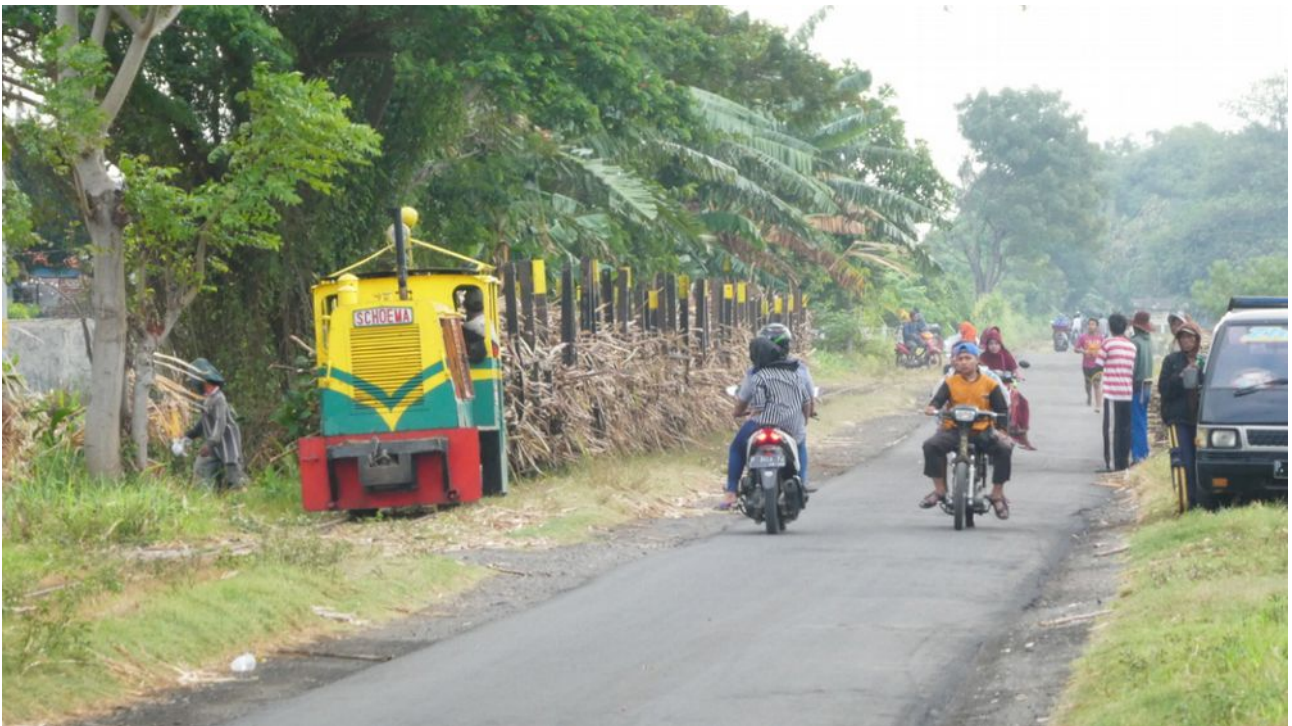
No. 1 hauls its load along the roadside section close to the mill.