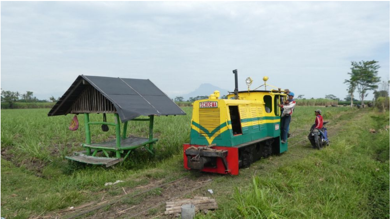
Having delivered the empties it returns to the mill. The field being cut is on the branch to Kandang close to the road from Wringinanom.