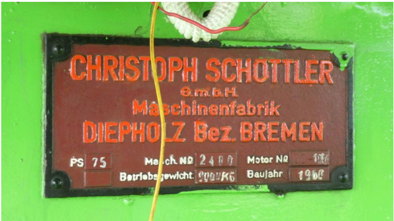
The plate inside the cab shows it was built in 1960.