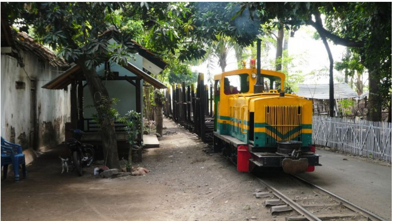
Also looking smart is one of the two Kyosan Kyogo diesels which have been part of the fleet for a long time. This one is now numbered 2 but on my last visit the working Schoema and Kyosan Kyogo locos were both numbered 1 and KK No.2 was dismantled awaiting a new engine. Whether this is KK 1 or 2 is not clear. My guess it is KK No. 1 renumbered.