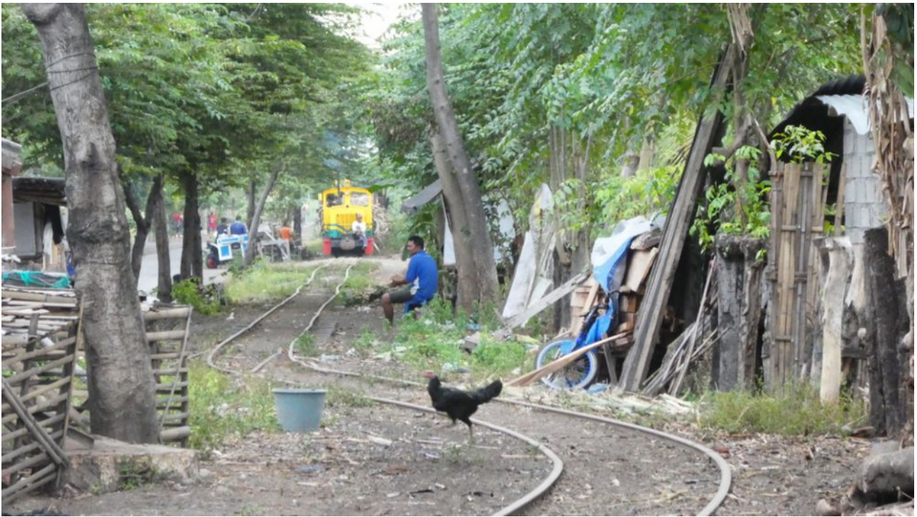
These two shots are of No. 2 approaching the mill entrance.