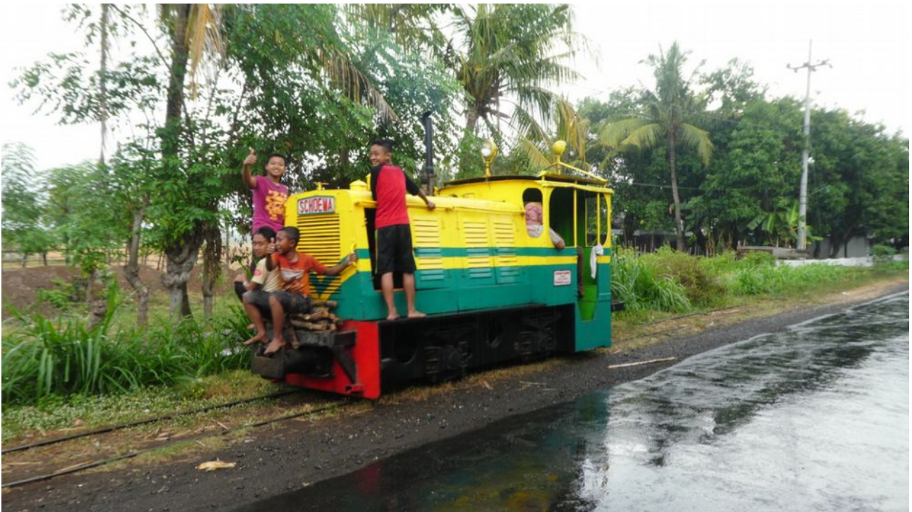
It was Saturday so No. 1 attracted a group of local boys looking for some excitement.