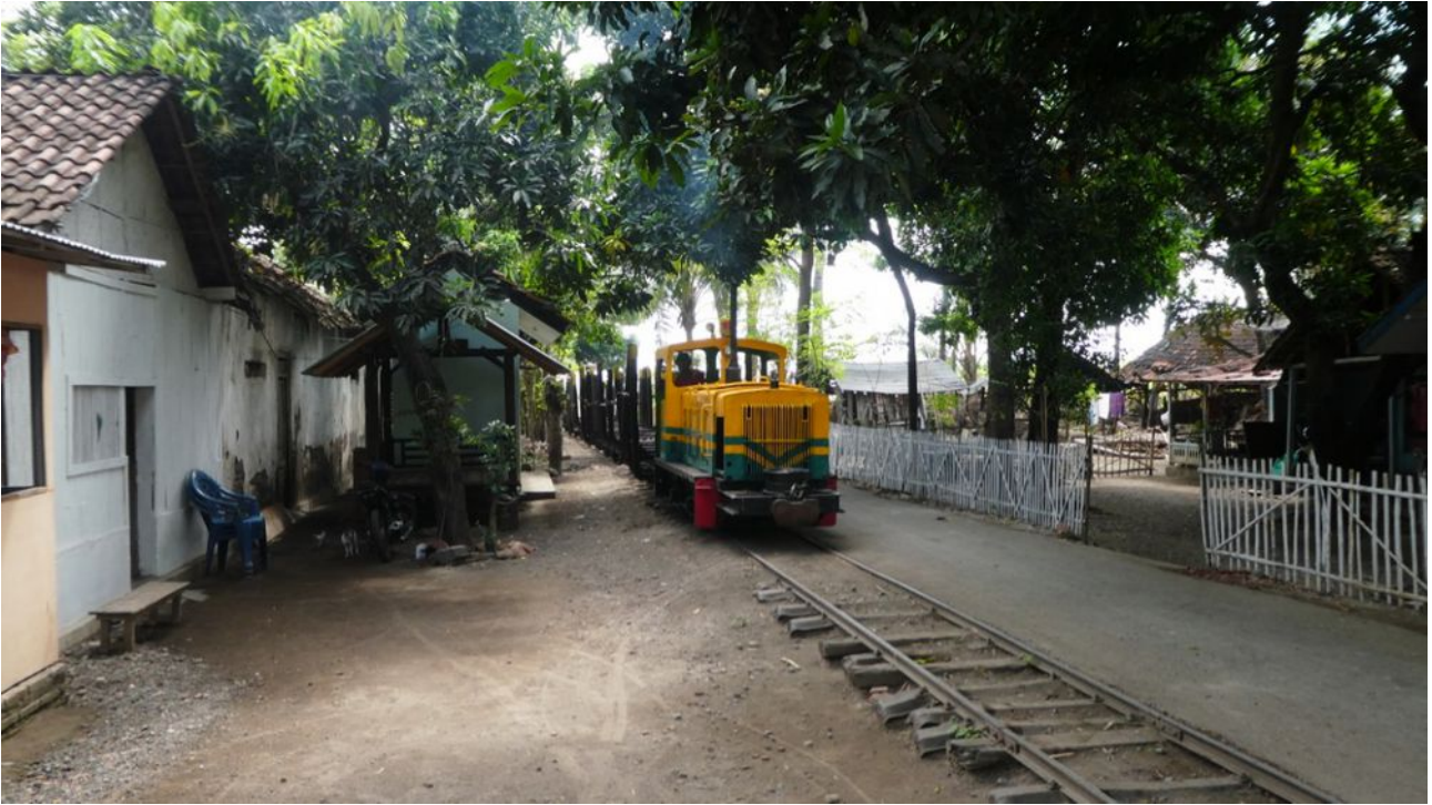
Just beyond the village of Duwet in this photo is the field being cut.