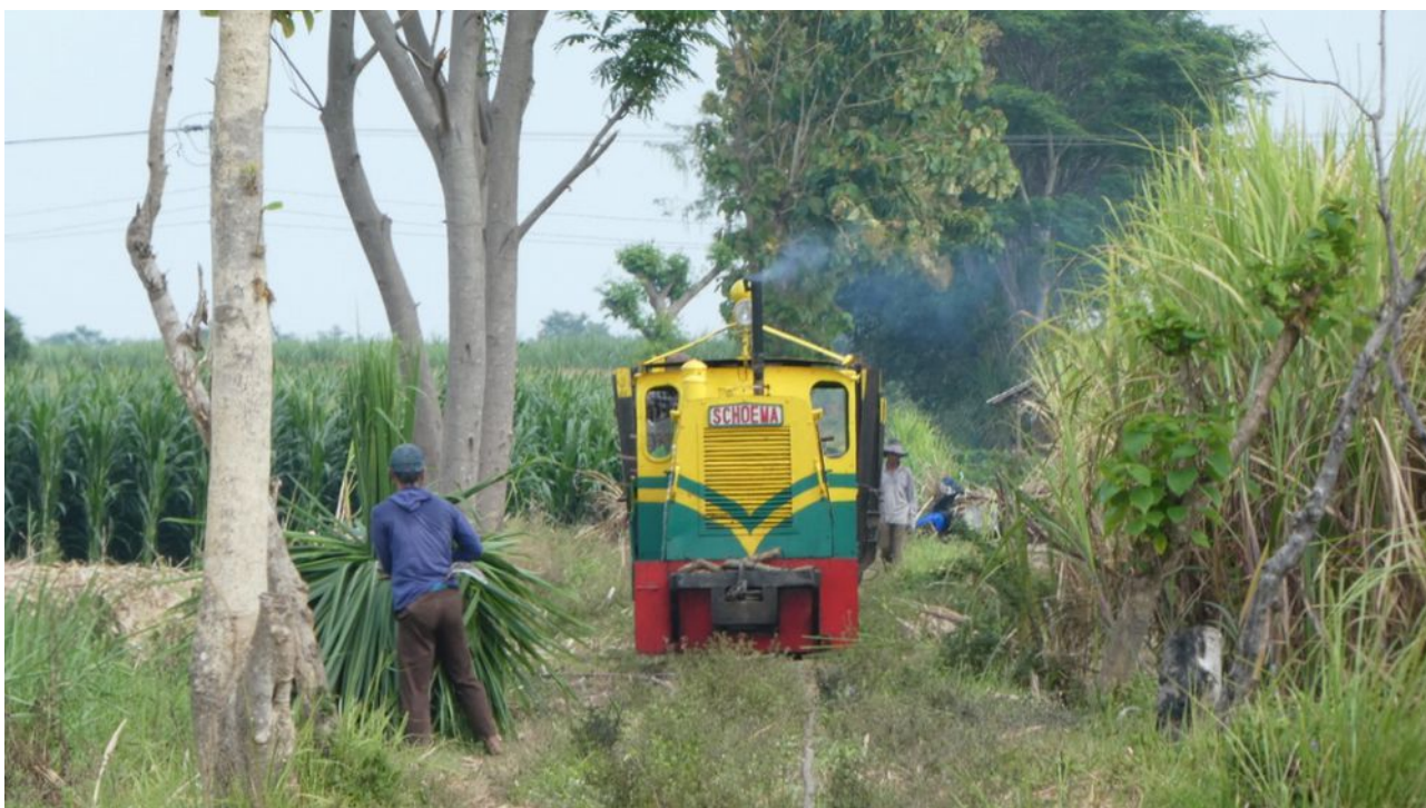
Smart new paint job on Schoema diesel No. 1. This loco has only been in the fleet for a couple of years.