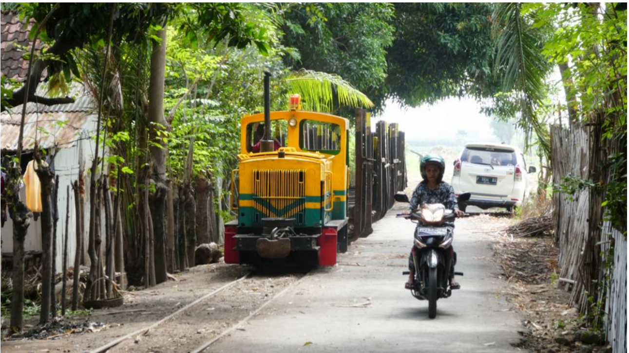
The loco was waiting for the empties to be taken into the field.