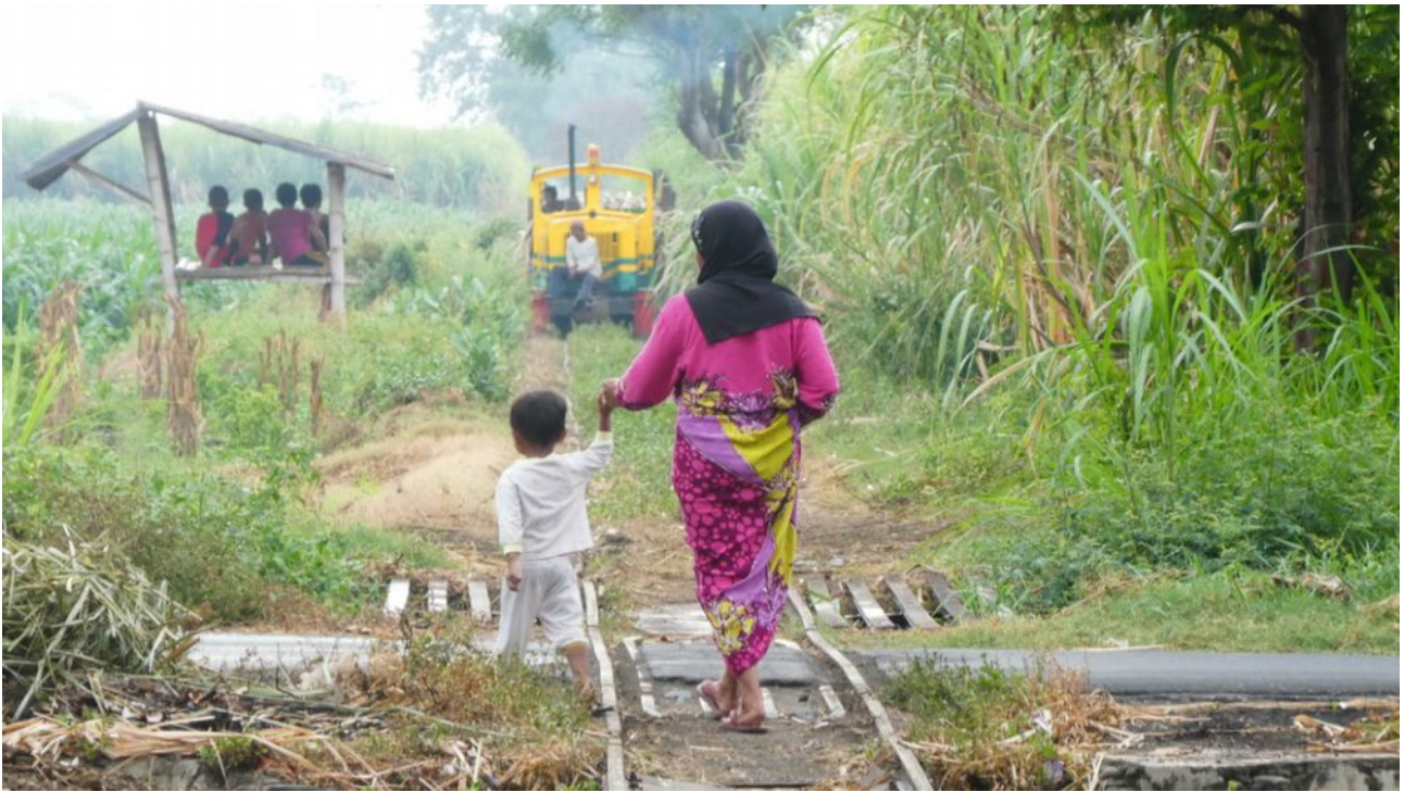
No. 2 brings a first train of loaded cane from Kandang. Mother and child are heading for their lift on a motorcycle.